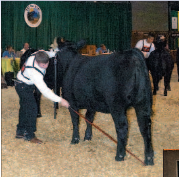
► Above: The top 15 showmen competed in the final round of the National Junior Angus Showmanship Contest Saturday morning.