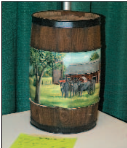
► Bidding opened Tuesday for the Silent Auction. By the conclusion of the show, more than $9,900 was raised for the Angus Foundation.

"I would like to go again next year. My goal is to someday run for Miss American Angus and possibly the junior Angus board. I'm also involved in FFA and hope to run for state office. Being involved in NJAS activities is a great experience toward those goals."