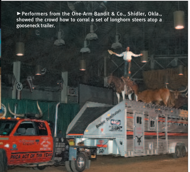
► Performers from the One-Arm Bandit & Co., Shidler, Okla., showed the crowd how to corral a set of longhorn steers atop a gooseneck trailer.