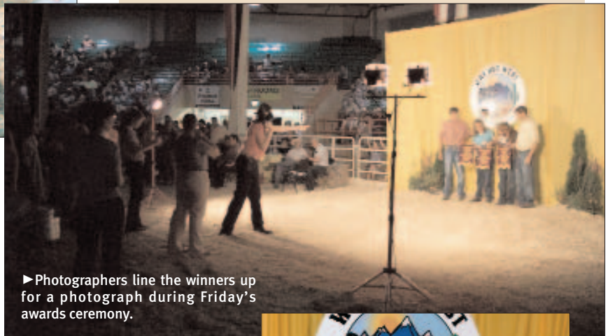
► Photographers line the winners up for a photograph during Friday's awards ceremony.