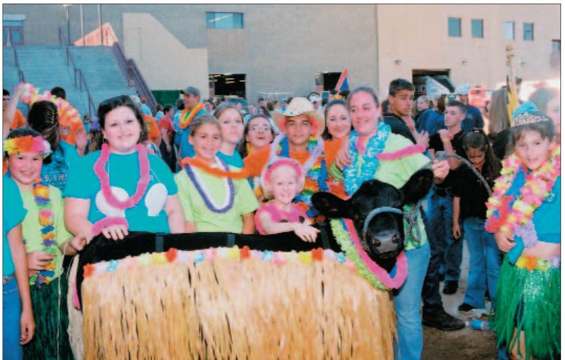
► Arkansas juniors prepare for the parade of states during opening ceremonies Monday evening.