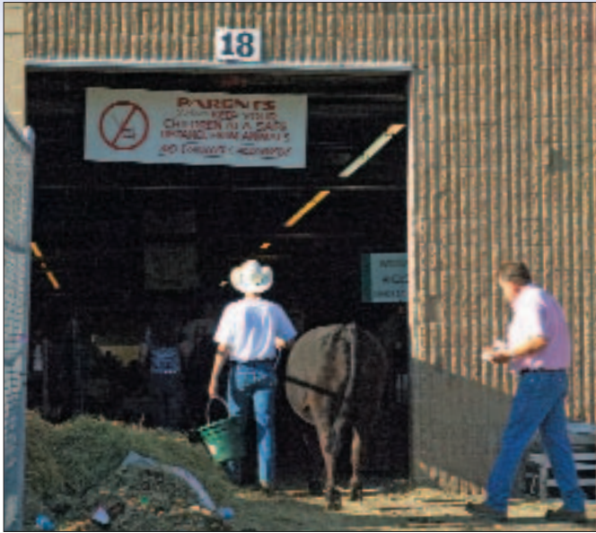
► Juniors bring their cattle into the barn, ready to begin a busy day.