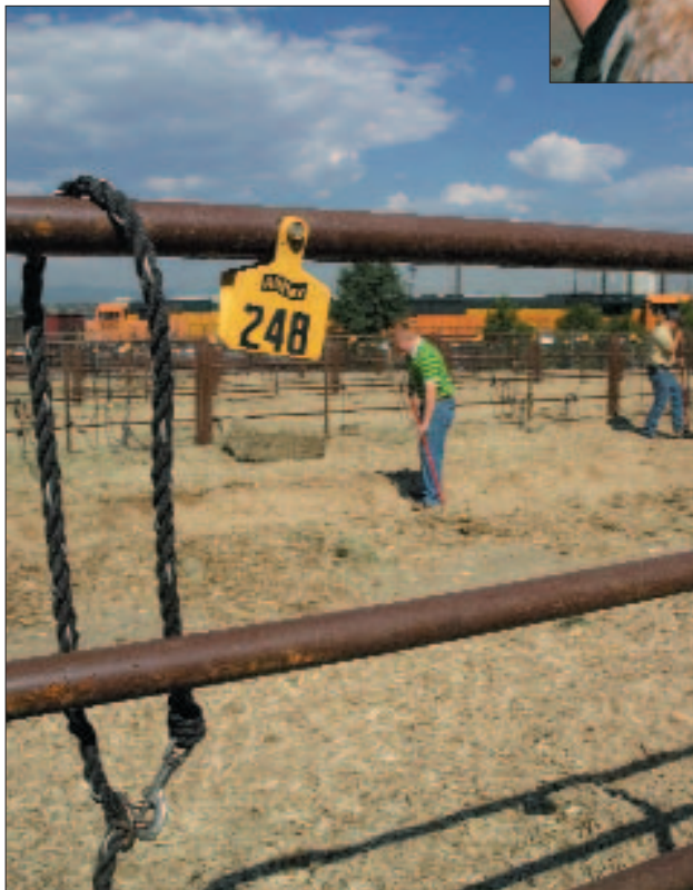
► Exhibitors take time during the day to prepare tie-outs.

“It’s a lot of fun. My favorite event was the Cook-Off. We had fun with our skit, which was based on the TV show Fear Factor . I’ve found you can always be doing something different here. You don’t even need to bring cattle to be involved, there are so many different contests. It’s all about meeting new people.”