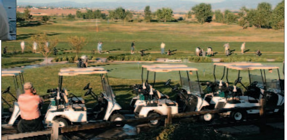
► Golfers hit the driving range before the Tournament. The scenic Thorncreek Golf Course features the Rocky Mountains as its backdrop.