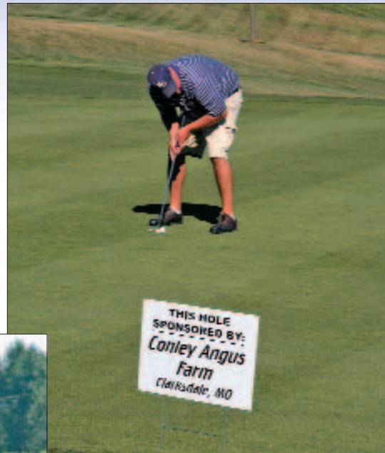
► Above: Players from several states compete for top prizes during the tournament. Each hole was sponsored by at least one generous supporter of the tournament.