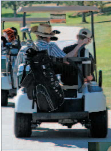
► Above: Mel Acres Ranch, Chappell Hill, Texas, served as the cart sponsor of the tournament.