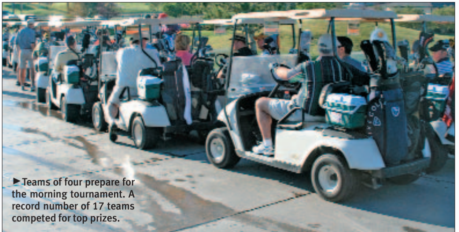
► Teams of four prepare for the morning tournament. A record number of 17 teams competed for top prizes.