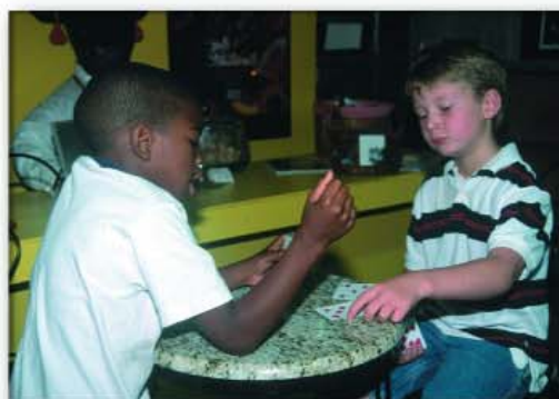
► Above: It doesn't take long for juniors to find something to do while waiting to show or participate in contests. Playing cards or sleeping are two popular selections.