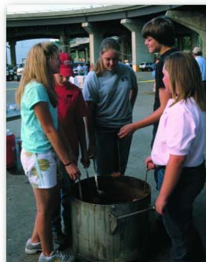
► NJAS attendees were provided many meals throughout the week. The Grote Texas-style meal provides all the fixings, including Texas-style beans served from a deep pot.