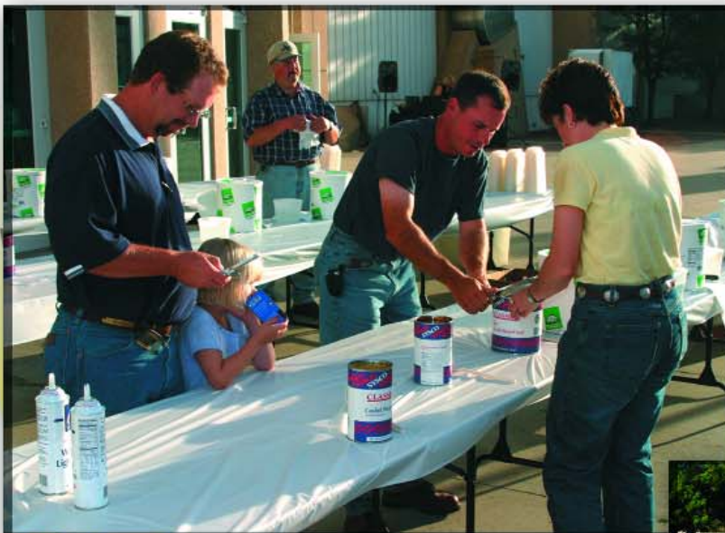
► Left: There is a lot to get ready in just a few minutes before opening ceremonies close. Nebraska parents help assemble the serving tables. Ice cream and toppings are usually donated by area businesses.