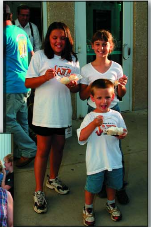
► Missouri juniors enjoy their banana splits made just like they like them.