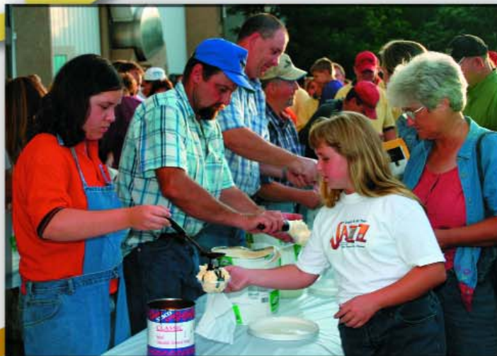
► Left: NJAS exhibitors and their families have enjoyed the ice cream social for the past five years. Toppings and bananas depend on where the NJAS is hosted each year and what is readily available.