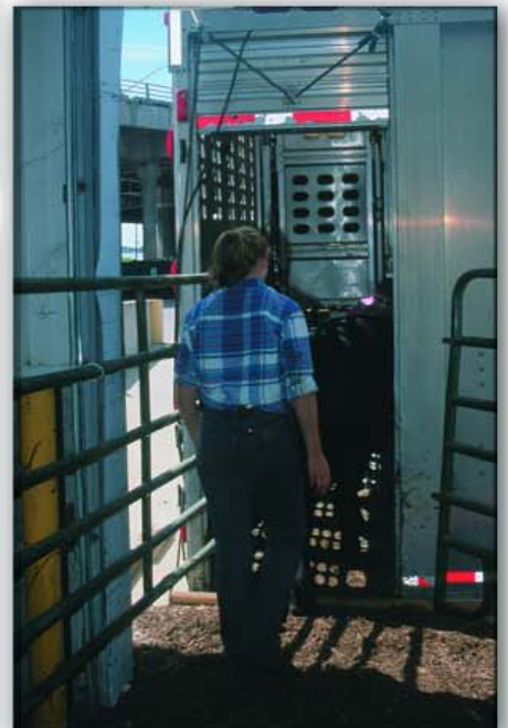
► A carcass steer is loaded on Wednesday of the NJAS. The carcass steer contest was started in 1985 to increase awareness among juniors of their steers' roles beyond the showing.