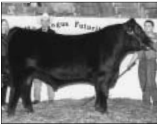
► Grand champion bull, GPN TV Precision 2N39 , by Brett Naylor, Buffalo. He's an Oct. 2002 son of Twin Valley Precision E161.