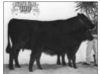
► Reserve grand champion female, SA Miss Frontier 153 , by RX Angus, Blountville. She's a Feb. 2003 daughter of B/R New Frontier 095.