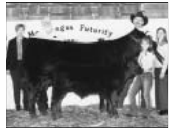
► Reserve grand champion female, Circle A Maxine 1509 , by Circle A Ranch, Iberia. She's a Dec. 2001 daughter of Baldrige Jethro 75J.