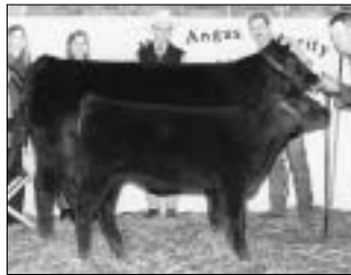
► Grand champion female, SydGen Forever Lady 1335 , by Sydenstricker Genetics, Mexico. She's a Sept. 2001 daughter of PAPA Durabull 9805.