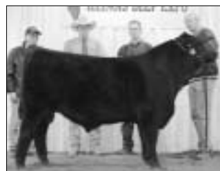
► Reserve grand champion bull, PVF Precision 302 , by Prairie View Farm, Gridley. He's a Jan. 2003 son of Twin Valley Precision E161.