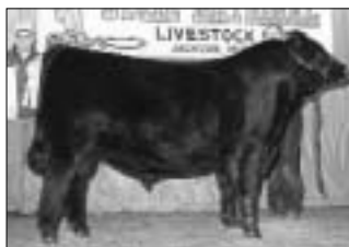
► Reserve junior champion, MCM Famous Amos , by MCM Farms, Whitestown, Ind. He's an April 2002 son of Famous 7001.