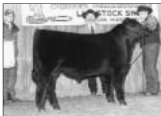
► Reserve junior calf champion, LaGrand Unique 3618 , by LaGrand Angus Ranch, Freeman, S.D. He's a March 2003 son of Roth's Millcreek Unique.