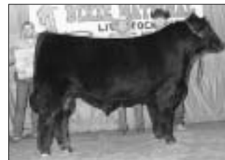
► Intermediate champion, EXAR Improvement 2764 , by Express Angus Ranches, Shawnee, Okla., and Double D Angus Ranch, Taylorsville, Miss. He's a June 2002 son of Northern Improvement 4480 GF.