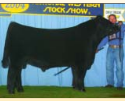
► Reserve early fall calf champion, G13 Stockman 2244 , by G13 Angus Ranch Inc., Lubbock, Texas. Tri State Livestock Auction Co., Lubbock, Texas, purchased two-thirds interest in the Sept. 2002 son of TC Stockman 365.