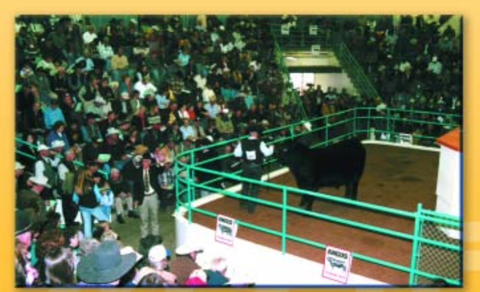
►Bulls that sell through the only American Angus Association-sponsored sale are paraded before a standing-room-only crowd of buyers from across the world. The high-selling bull sold for $60,000.