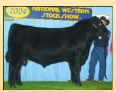
► Reserve intermediate champion, LLA Forever Ready 211 , by Lakeland Farm, Palmyra, Wis. Turner Ranch, Evanston, Wyo., purchased the May 2002 son of Maple Lane Forever Ready 850.