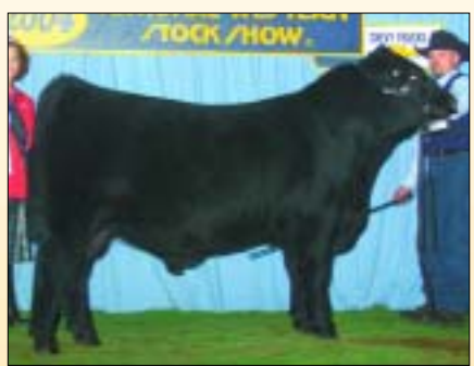
▶ Reserve late fall calf champion, Westward Skyline 217W , by Westward Angus, Eldorado, Ohio. A&C Angus, Roosevelt, Utah, purchased two-thirds interest in the Dec. 2002 son of Twin Valley Precision E161.