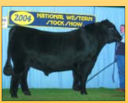
► Senior champion, Rosewood Apache 1084 , by Rosewood Cattle Co., Salem, Ill. Panther Creek Farms, Pink Hill, N.C. purchased twothirds interest in the Nov. 2001 son of Leachman Saugahatchee 3000C.