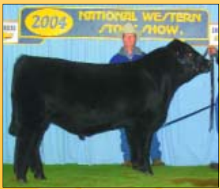
► Early winter calf champion, Kemmer 1407 Titan 40N, by Kemmer Farms, Crossville, Tenn. BLC Angus Ranch, Shawnee, Okla., purchased two-thirds interest in the Jan. 2003 son of Bon-View New Design 1407.