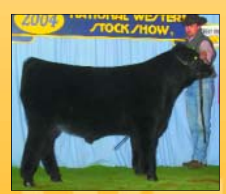
► Reserve late winter calf champion, PF 104 Freedom 3038 , by Pollard Farms LLC, Enid, Okla. Belle Point Ranch, Fort Smith, Ark., purchased the Jan. 2003 son of TC Freedom 104.