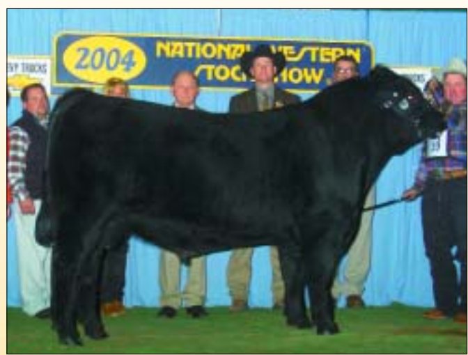
► Grand and intermediate champion bull, OAR Northern Legend 0143 , by Odell Angus Ranch, Byars, Okla. The May 2002 son of Northern Improvement 4480 GF was purchased by Top Line Farm, Tremont, Ill.