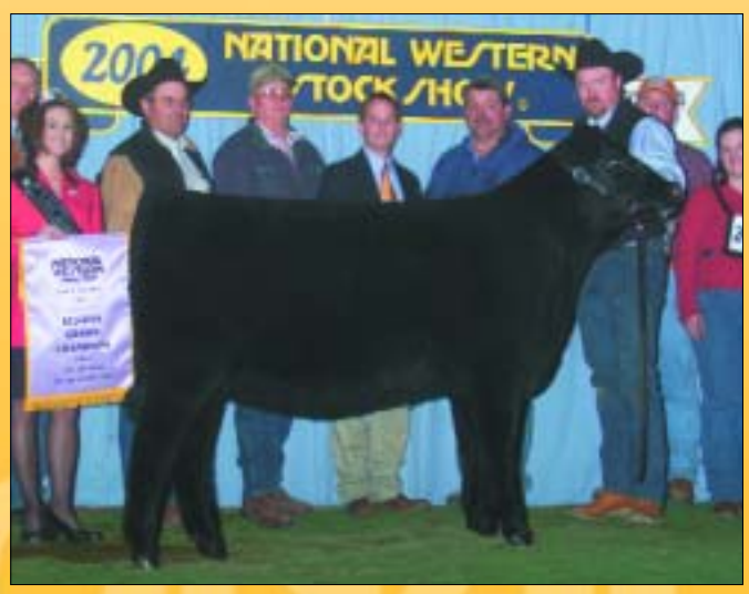
► Reserve grand champion and winter heifer calf champion, WK Exciting Elluna 3173, by Whitestone-Krebs, Gordon, Neb. She's a Feb. 2003 daughter of BR Midland.