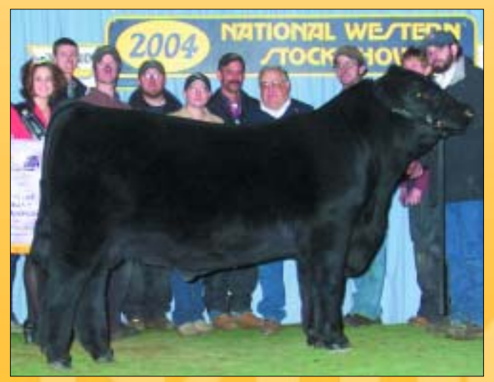
▶ Reserve grand champion and winter calf champion bull, WCC Extra Stout N7, by Wilson Cattle Co., Cloverdale, Ind. He's a Jan. 2003 son of TC Extra 9140.