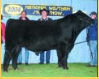
► Reserve intermediate champion, EXAR New Look 2971 , by Express Angus Ranches, Shawnee, Okla. He's an Aug. 2002 son of Bon-View New Design 1407.