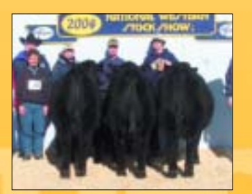
Champion yearling pen, by Rolling RRR Ranch LLC, Edmond, Okla. The sons of Bon-View New Design 1407 were born Sept.-Oct. 2002.