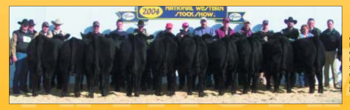
Reserve grand champion carload, by TC Ranch Inc., Franklin, Neb. The 10 sons of Connealy Forefront, TC Freedom 104, TC Moonshine 001, BCC Bushwacker 41-93 and Woodlawn Exact Replica 611 were born Jan.-Feb. 2003.