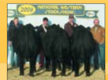
▶ Reserve late calf champion pen, by A&B Cattle, Bassett, Neb. The sons of BR Midland were born Feb.-March 2003.