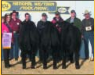
Reserve champion yearling pen, by LaGrand Angus Ranch, Freeman, S.D. The sons of B/R New Frontier 095 and Famous 7001 were born Dec. 2002.