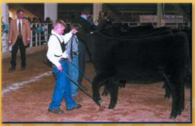
▶ Juniors set up their heifers for the judge. The junior show was the first Angus showring event of the 2004 NWSS.