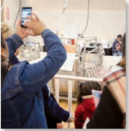
► The Birthing Center attracts a lot of attention. Signage explains facts about livestock birth (like farrowing crates, for example).