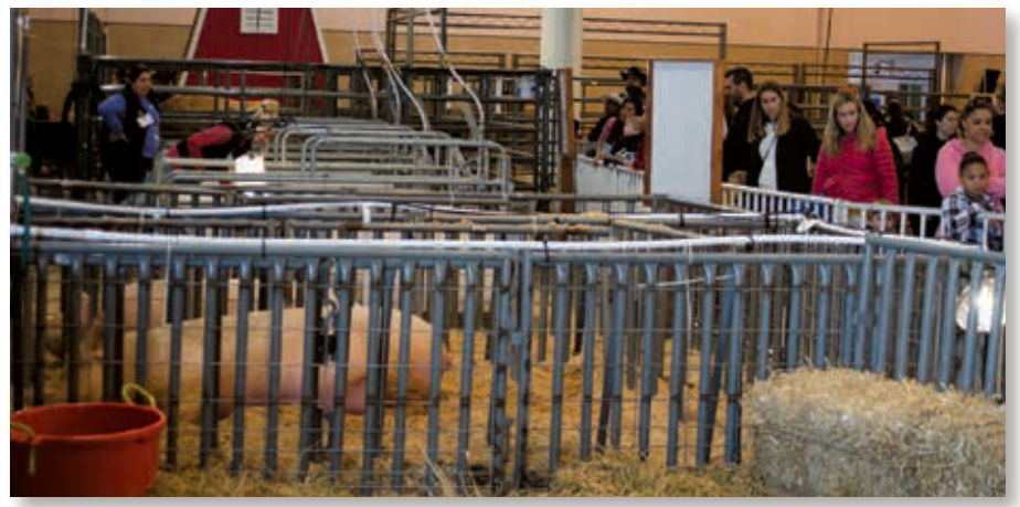
► Attendees can see live births of cattle, sheep and pigs if they come at the right time at the Birthing Center.

"So many kids in the city are never exposed to this. They might not think about where their food comes from. This is like a wonderland to them," she notes.