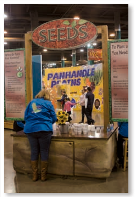
► The horticulture exhibit offers hands-on engagement, like planting sunflower seeds.