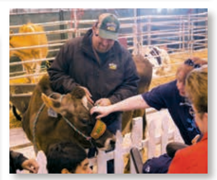
► The Milking Parlor shows the milking process during demonstration times. Additionally, attendees can meet the dairy cows.