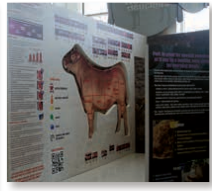
► Agriculture is showcased throughout the NRG Center, not just within the AGventure section. There are Pasture to Plate and Consumer Guides outside in the main hallway in the NRG Center and near the Main Arena.