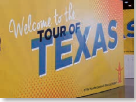
► The Tour of Texas showcased agriculture close to home for any Texan. Exhibits showed agricultural specialties from each of the seven regions, including rice, cotton, wine grapes, oranges, cattle and more.