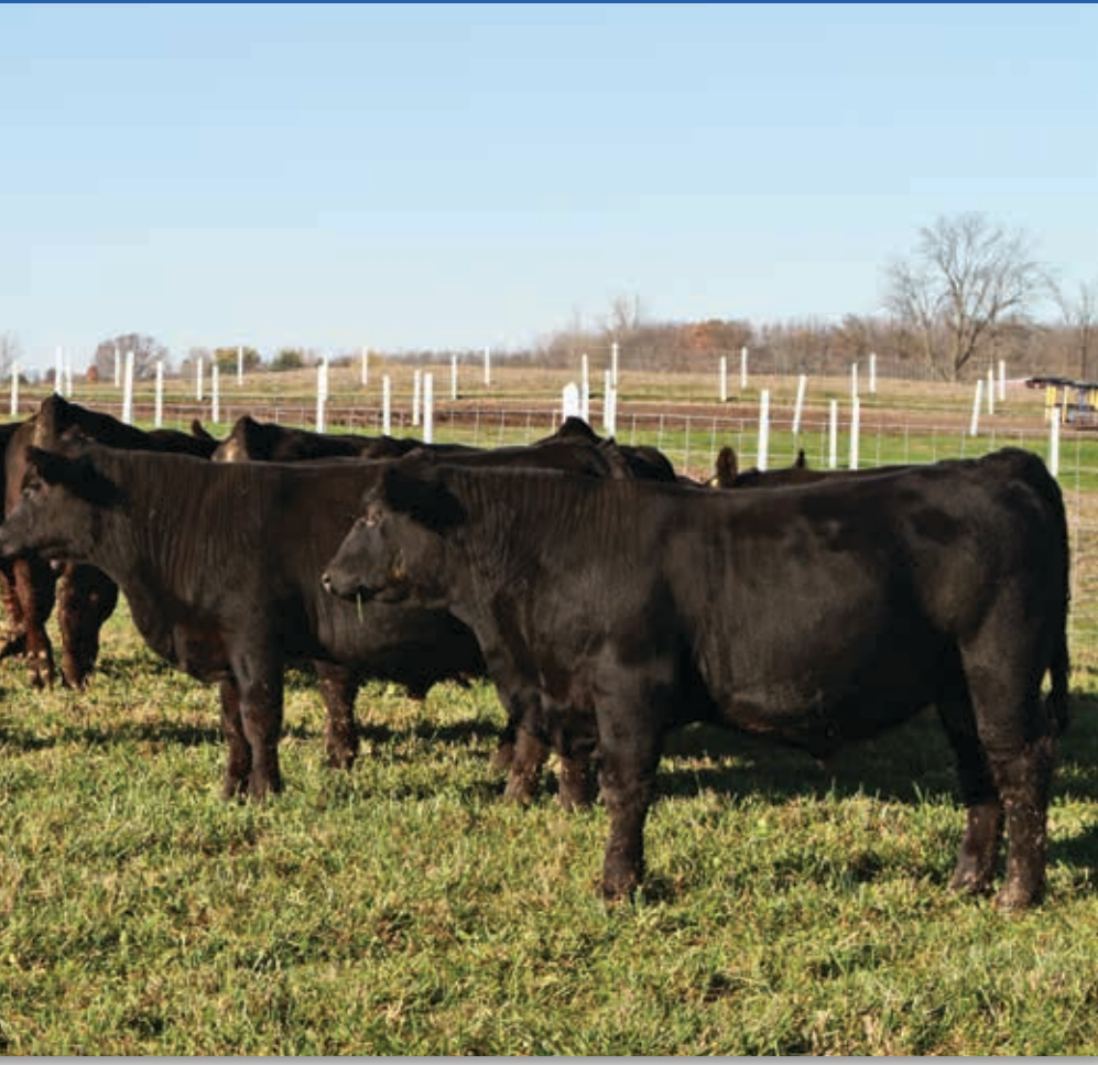
► Above: The tour wrapped up with Coverdale Angus in Frankton, Ind.