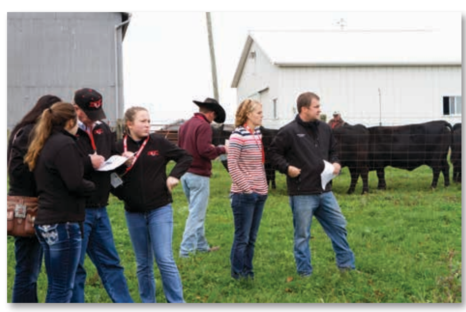
► Above: Stewart Select Angus, Greensburg, Ind., has been breeding quality Angus cattle since 1955.

For short overviews of each farm, see "Hoosier Hospitality" in the June 2016 Angus Journal (pages 100-101). For more news from the Angus Convention including summaries, speaker presentations, photos, videos and much more — visit the convention newsroom at www.angus.media/ news/Angus-Convention.