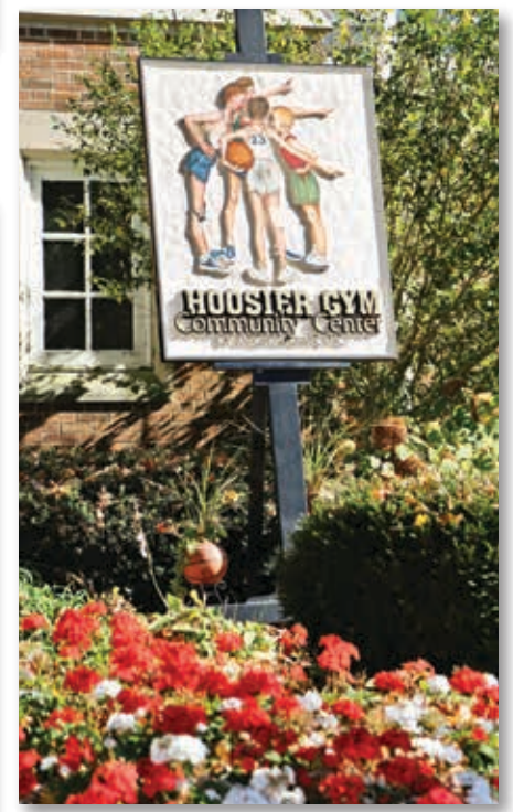
► Above: The National Angus Tour took a break from cattle production to explore the historic Hoosier Gym in Knightstown, Ind.