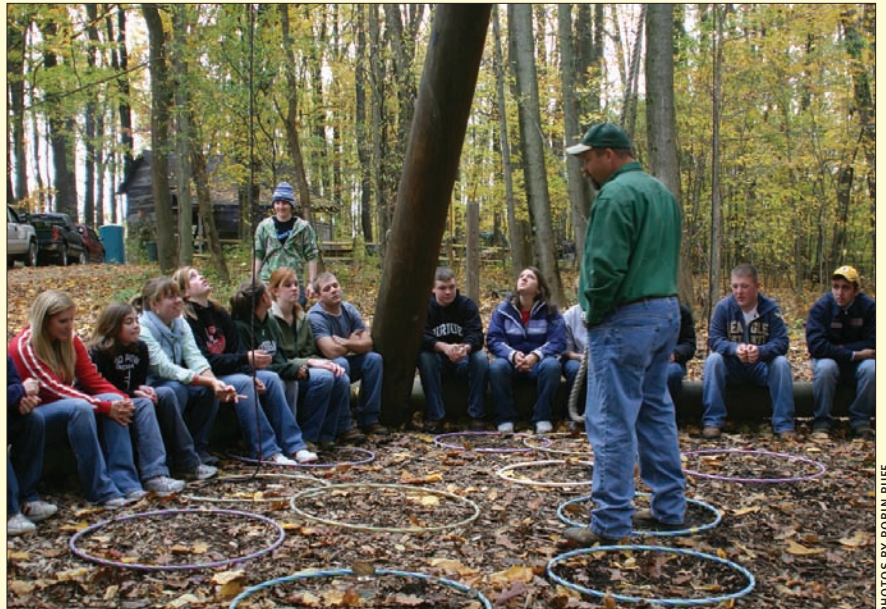
▶ Attendees take time to reflect on how the ropes course can help them be better Angus leaders.