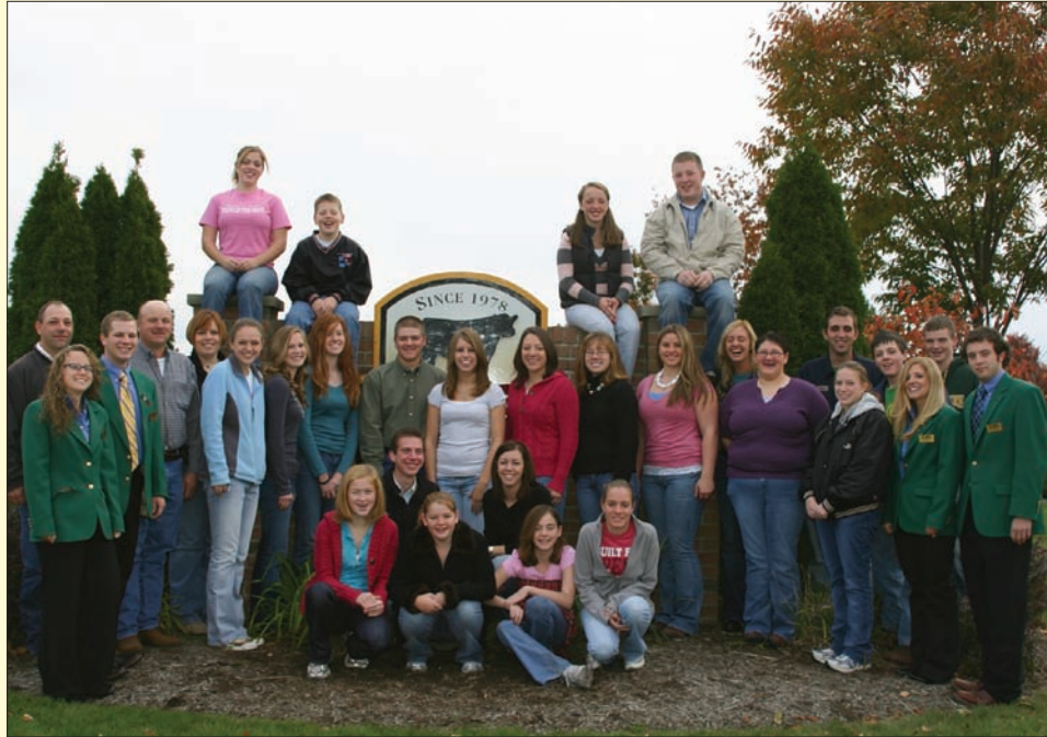
▶ Raising the Bar participants gather for a picture at the CAB office in Wooster, Ohio.

The workshops at the Raising the Bar conference covered topics such as the secrets of the American Angus Association, fundraising and budgets, membership, public speaking, scholarships and awards, and parliamentary procedure. Some of the activities the attendees participated in were