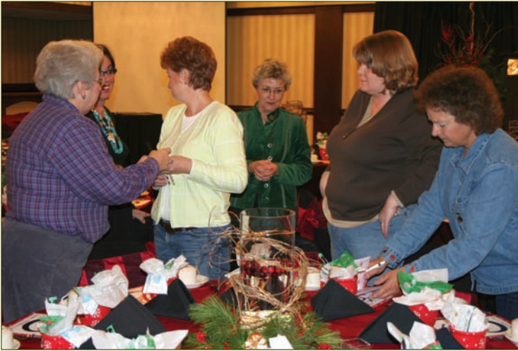
► Willing hands make short work of preparations for Sunday's Auxiliary breakfast.