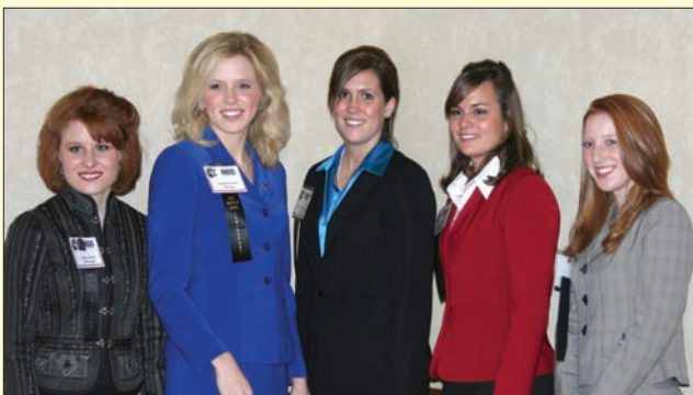
► Five contestants vied for the title of Miss American Angus Saturday and Sunday during the NAILE. They earned the right to compete through the American Angus Auxiliary's girls' scholarship competition earlier this year. The five competed via a written quiz, interview, impromptu questions and by preparing a speech.