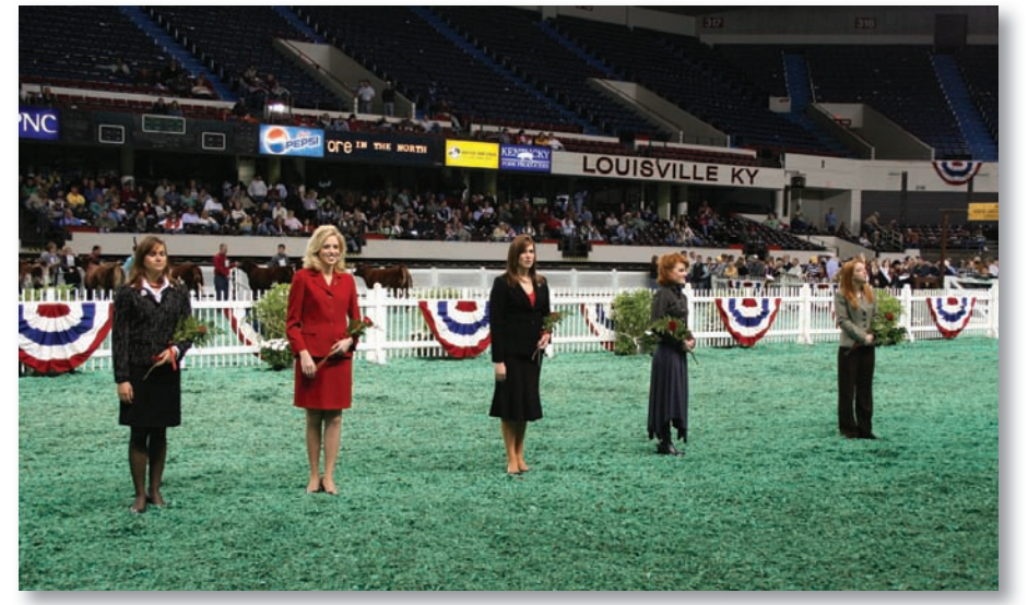
Contestants for Miss American Angus line up in the ring Monday morning prior to selection of the grand champion bull.