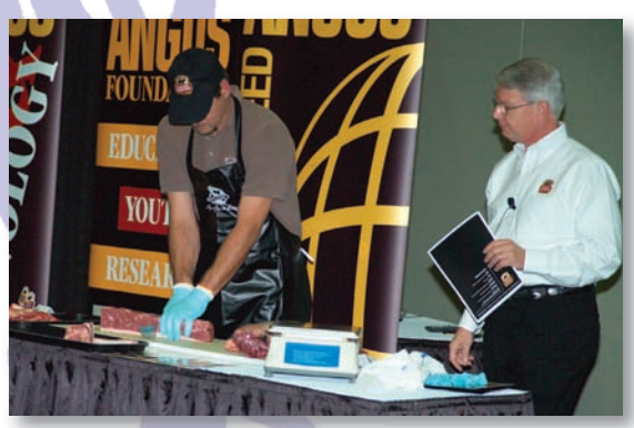
► CAB provided a cutting demonstration Monday during an Angus Education Center. The session featured new cutting methods to help licensees market larger cuts in a more appealing package.