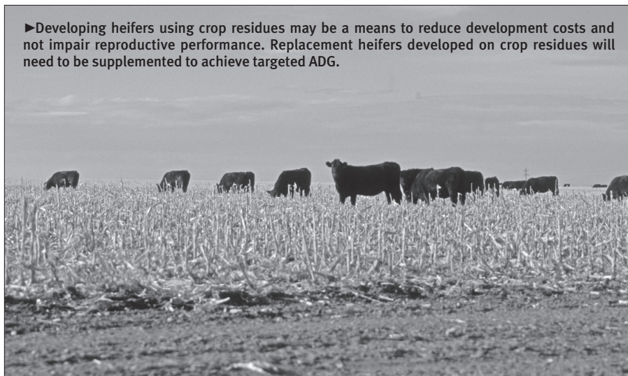
Fig. 1: ADG of calves supplemented DDGS while grazing corn residue

► Developing heifers using crop residues may be a means to reduce development costs and not impair reproductive performance. Replacement heifers developed on crop residues will need to be supplemented to achieve targeted ADG.