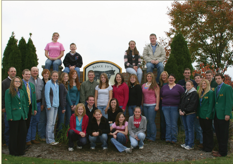
▶ Raising the Bar participants gather for a picture at the CAB office in Wooster, Ohio.

The workshops at the Raising the Bar conference covered topics such as the secrets of the American Angus Association, fundraising and budgets, membership, public speaking, scholarships and awards, and parliamentary procedure. Some of the activities the attendees participated in were