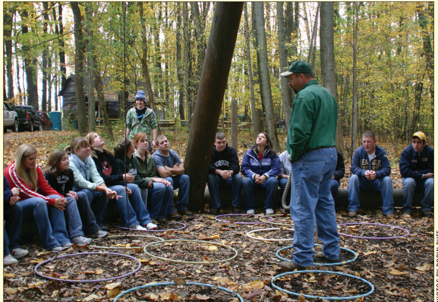
▶ Attendees take time to reflect on how the ropes course can help them be better Angus leaders.