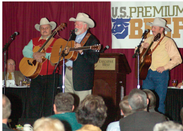
► Red Steagall provided the entertainment during Monday evening's American Angus Association Annual Banquet.