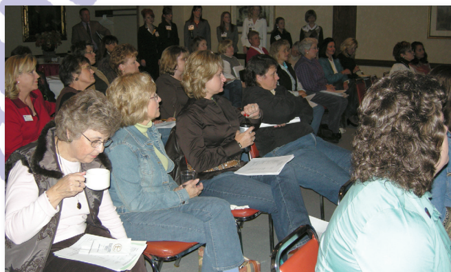
▶ Left: The American Angus Auxiliary elected officers and made changes to its bylaws Saturday, Nov. 10.