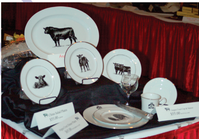
► Angus enthusiasts had the opportunity to get a jump-start on Christmas shopping by visiting the Holiday Room at the Executive West Hotel.