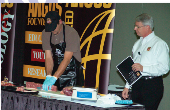
► CAB provided a cutting demonstration Monday during an Angus Education Center. The session featured new cutting methods to help licensees market larger cuts in a more appealing package.