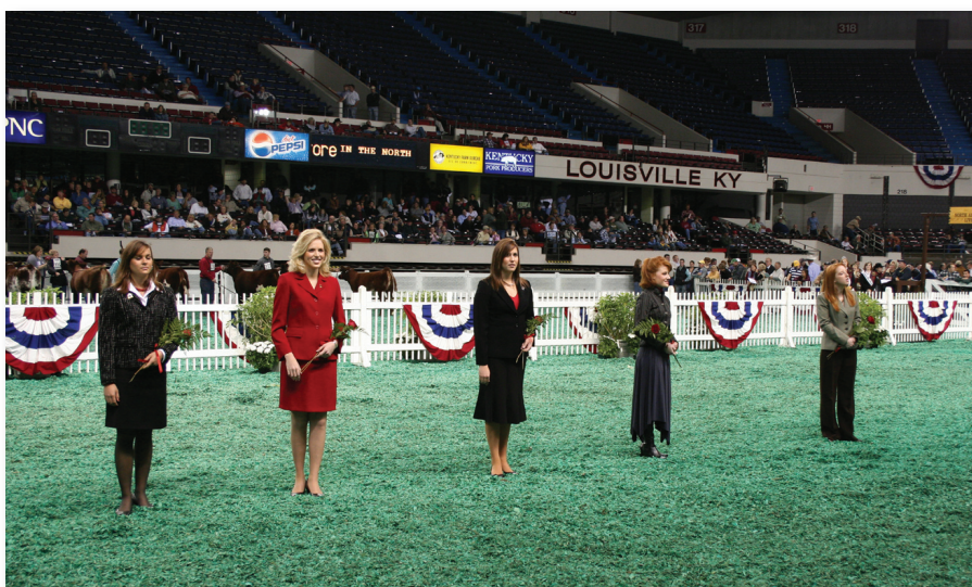
► Contestants for Miss American Angus line up in the ring Monday morning prior to selection of the grand champion bull.