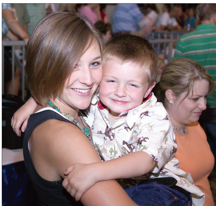
CONTINUED ON PAGE 194