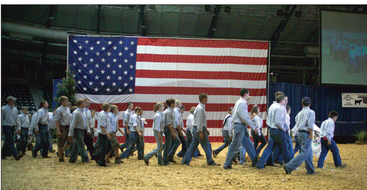
► State by state, juniors paraded before the flag to kick off the official beginning of The American Dream.