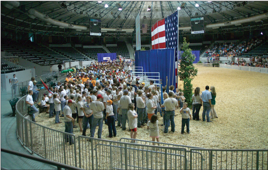
► Juniors from across the country lined up behind the curtain before the Opening Ceremonies Monday evening at the National Junior Angus Show in Tulsa, Okla.