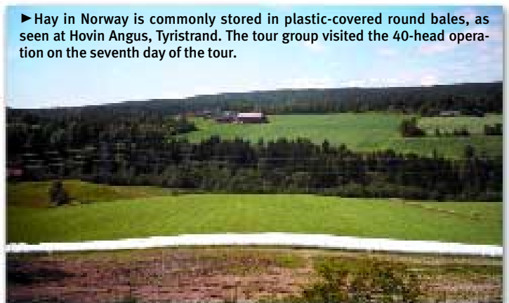
► Hay in Norway is commonly stored in plastic-covered round bales, as seen at Hovin Angus, Tyristrand. The tour group visited the 40-head operation on the seventh day of the tour.