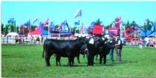
► The grand champion Angus cow, owned by Vesterskoven Angus, competes in the interbreed competition at the Animal Show in Hjørring, Denmark.