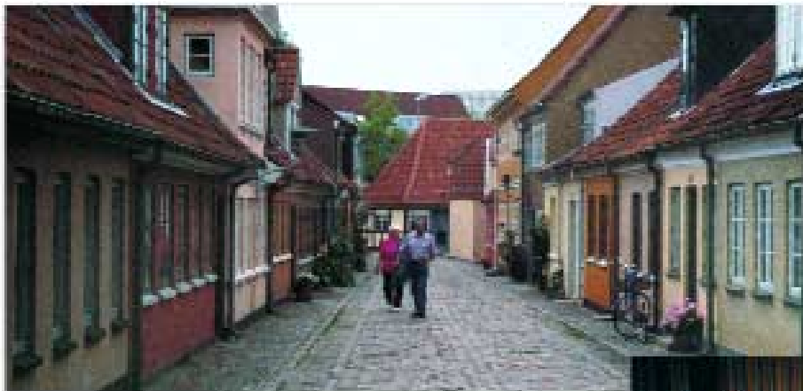
► Odense, Denmark, the childhood home of world-renowned fairy-tale author Hans Christian Andersen, was just one of the many stops on the tour.

For more scenes from the 2003 World Angus Secretariat Technical Meeting and Tour, visit www.angusinternational.com .