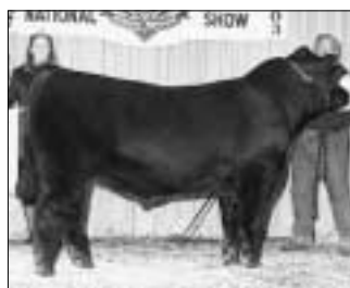
► Late spring bull calf champion, WCC Big Daddy M145 , by Wilson Cattle Co., Cloverdale, Ind. He's an April 2002 son of TC Extra 9140.