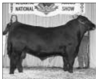
► Reserve early spring bull calf champion, LaGrand Roth Forever Rdy 253 , by LaGrand Angus Ranch, Freeman, S.D., and Masters Cattle Co., Bashaw, Alta., Canada. He's a Jan. 2002 son of Maple Lane Forever Ready 850.