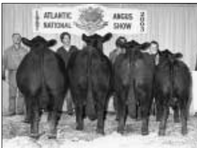
► First-place get-of-sire, progeny of Leachman Saughatchee 3000C , by Champion Hill, Bidwell, Ohio, and Fox Cross Farm, Alderson, W.Va.