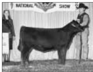
► Reserve late fall heifer calf champion, Blanche 2218 of Foxcross , by Fox Cross Farm, Alderson, W.Va. She's a Nov. 2002 daughter of Vermilion Dateline 7078.