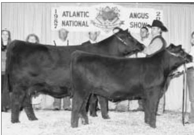
► Supreme champion, senior yearling and grand champion female, and grand champion cow-calf pair, Champion Hill Lady 2185 , by Champion Hill, Bidwell, Ohio, and Fox Cross Farm, Alderson, W.Va. She's a Sept. 2000 daughter of Leachman Saugahatchee 3000C. Her calf is a Sept. 2002 daughter of WVF HB Atlantic Nat'l Merit.