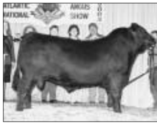
► Reserve intermediate champion bull, Rolling Hills KAW Widespread , by Rolling Hills Angus, Duncannon, Pa. He's a May 2001 son of Whitestone Widespread MB.