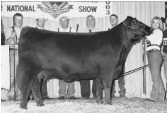
► Reserve grand champion and junior champion female, Champion Hill Georgina 2335 , by Champion Hill, Bidwell, Ohio, and Fox Cross Farm, Alderson, W.Va. She's a Jan. 2001 daughter of Leachman Saughatchee 3000C.