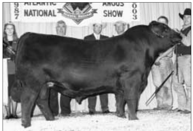
► Reserve grand champion and reserve junior champion bull, SAV 5175 Bando 1024 , by Horsley Cardinal Angus, Wyoming, Ill.; Sterling Land & Cattle, Weatherford, Texas; and Fox Cross Farm, Alderson, W.Va. He's a Jan. 2001 son of SAF 598 Bando 5175.