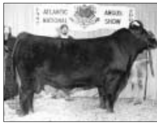
► Senior champion bull, WCC Stocky J162 , by Wilson Cattle Co., Cloverdale, Ind. He's an April 2000 son of TC Stockman 365.