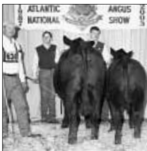
► First-place produce-of-dam, Champion Hill Georgina 901 , by Champion Hill, Bidwell, Ohio.