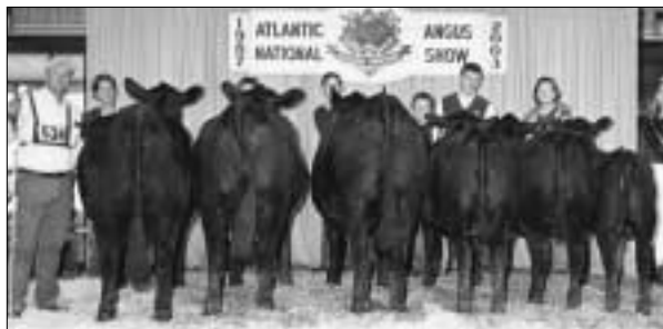
► First-place breeder's-six-head entry, by Champion Hill , Bidwell, Ohio.