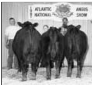
► First-place junior get-of-sire, progeny of Twin Valley Precision E161 , by Wilson Cattle Co., Cloverdale, Ind.