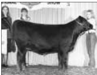
► Late summer heifer calf champion, Champion Hill Phyllis 3041 , by Champion Hill, Bidwell, Ohio, and Fox Cross Farm, Alderson, W.Va. She's a July 2002 daughter of Leachman Saughatchee 3000C.