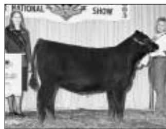
► Early fall heifer calf champion, Champion Hill Shadoe 3130 , by Champion Hill, Bidwell, Ohio, and Fox Cross Farm, Alderson, W.Va. She's a Sept. 2002 daughter of SAV Limited Edition 9283.