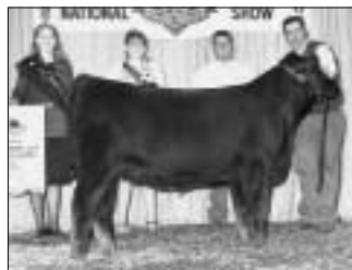
► Reserve late summer heifer calf champion, Dalton's Monique 2206 , by Seth Buckley, White Post, Va. She's an Aug. 2002 daughter of Bon-View New Design 1407.