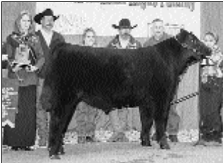
► Grand champion steer, Green's TM Express 2013 , by Ashley Berkram, Park King, Mont. He's an April 2002 son of Northern Express 0424 and weighed 1,104 lb. on show day.