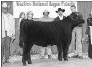
► Reserve grand champion bred-and-owned female, Five Star 645 Echo 2033 , by Ryan Nelson, Wilton, Calif. She's an April 2002 daughter of Twin Valley Precision E161.