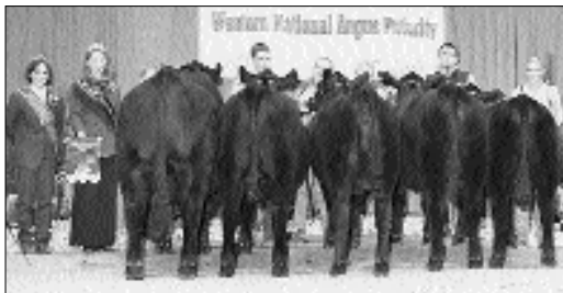
► Members of the Oregon Junior Angus Ass'n exhibit the first-place state group of five.