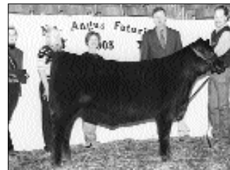
► Reserve grand champion female, Clearwater Barbara 1402 , by Clearwater Farm, Springfield. She's a March 2002 daughter of Clearwater PAF Seville 1977.