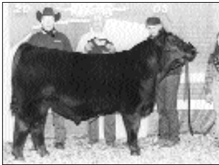
► Grand champion bull, QLC Structure H447N , by Quirk Land and Cattle Co., Hastings. He's a March 2002 son of G13 Structure.