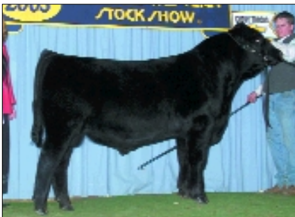
► Reserve winter calf champion, PF Denton 2005 , by Pollard Farms LLC, Enid, Okla. He's a Jan. 2002 son of ER Denton K240.