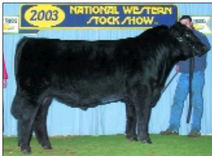
► Intermediate champion, WCC High Alert L494 , by Wilson Cattle Co., Cloverdale, Ind. He's a May 2001 son of Vermilion Dateline 7078.