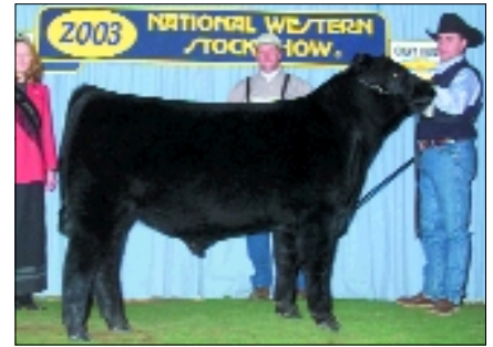
► Winter calf champion, Triple J Design of Foxcross , by Triple J Farms, Glen Allen, Va., and Fox Cross Farm, Alderson, W.Va. He's a Jan. 2002 son of B/R New Design 323.