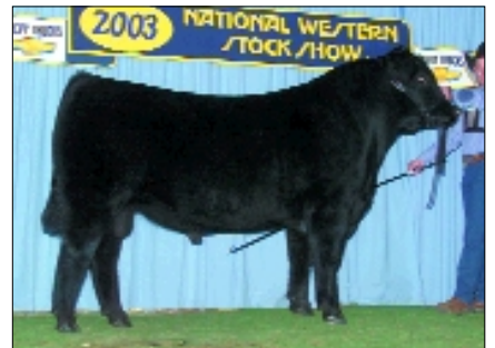
► Late junior champion, G13 Stunner 1125 , by G13 Angus Ranch Inc., Elida, N.M. He's a March 2001 son of TC Stockman 365.