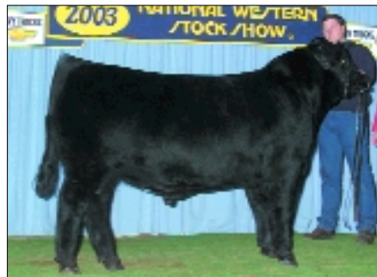
► Reserve late fall bull calf champion, ESP Classic 109 , by Jacob Espenscheid, Traer, Iowa. He's a Nov. 2001 son of Amdahl's First Class 12.