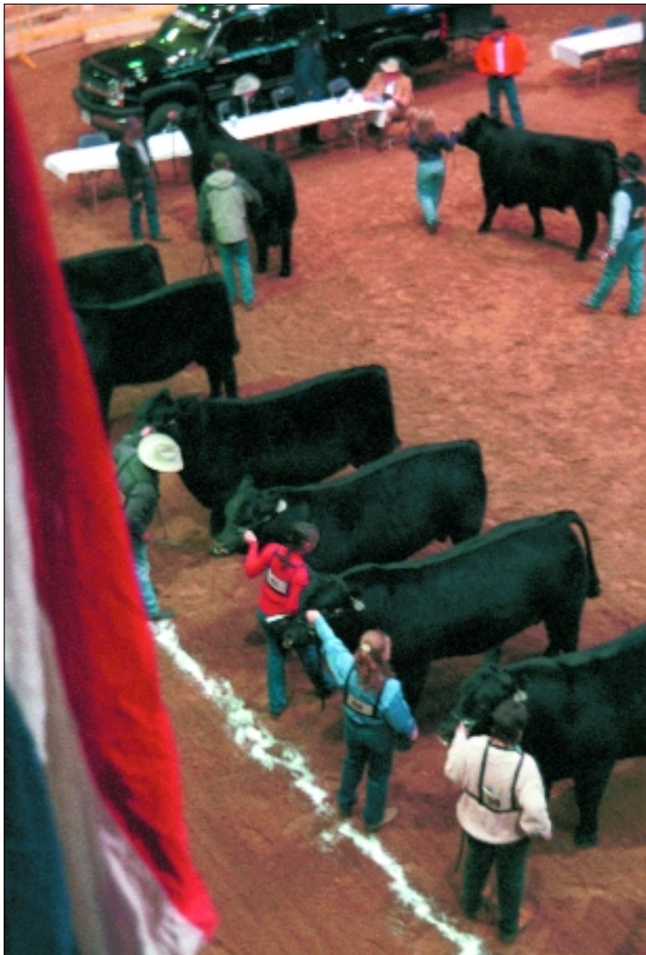
► Sale bulls lined the arena after the show, allowing breeders to evaluate the entries for themselves.