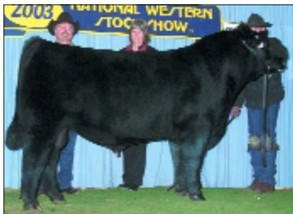
► Reserve early junior champion, SSR Battle Pride 2061 , by Sugar Springs Ranch, Lincoln, Ark. He's a March 2001 son of OGL Battle Cry 427 128.