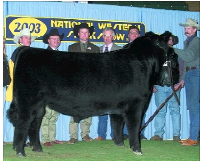
► Reserve grand champion and early junior yearling champion, WC 4480 Improvement 1C10 , by Laflin Ranch, Olsburg, Kan., and Hamilton Farms, Cochrane, Alta., Canada. He's a Feb. 2001 son of Northern Improvement 4480 GF.