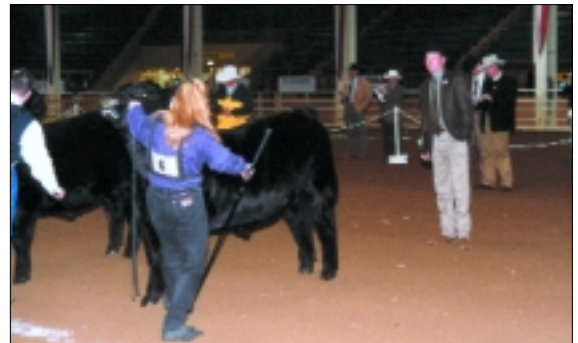
► Five judges evaluated 36 lots to determine sale order in the only American Angus Association-sponsored sale at the National Western Stock Show. The sale grossed $186,300.