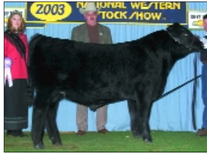
► Reserve early spring calf champion, Woodlawn Gold Member 312 , by L.B. Pierce & Sons Inc., Creston, Ill. He's a Feb. 2002 son of SAF 598 Bando 5175.