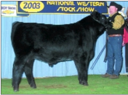
► Early spring calf champion, Boyd Front Page 2022 , by Boyd Beef Cattle, Mays Lick, Ky. He's a Jan. 2002 son of Connealy Frontline.