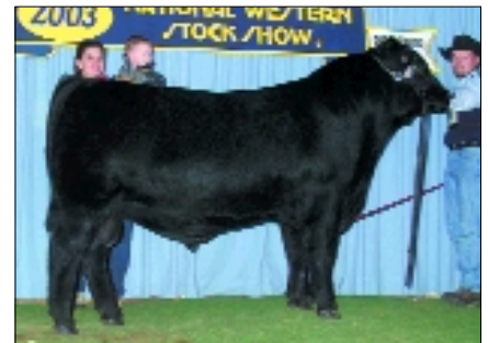
► Early fall bull calf champion, Westward Forever Ready 110W , by Westward Angus, Eldorado, Ohio. He's a Sept. 2001 son of Maple Lane Forever Ready 850.