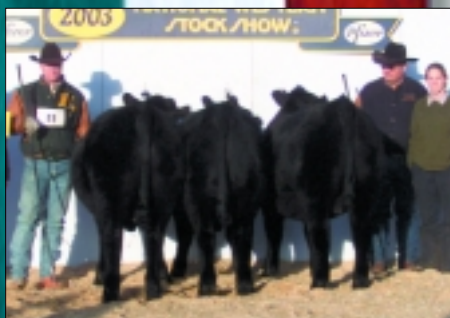
► Grand champion pen Whitestone-Krebs, Gordon, Neb. Bulls sired by Bon-View New Design 1407.