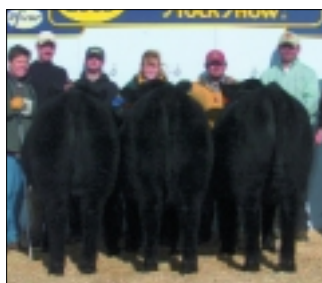
► Reserve late calf pen, by Oklahoma State University , Stillwater, Okla.