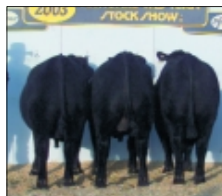
► Reserve yearling pen, by Circle A Ranch , Iberia, Mo.