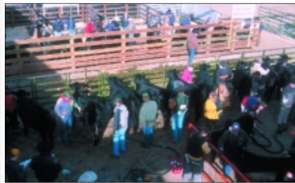
► On Saturday, breeders were busy fitting entries for the Angus carload and pen show, the last Angus event at the 2003 NWSS.