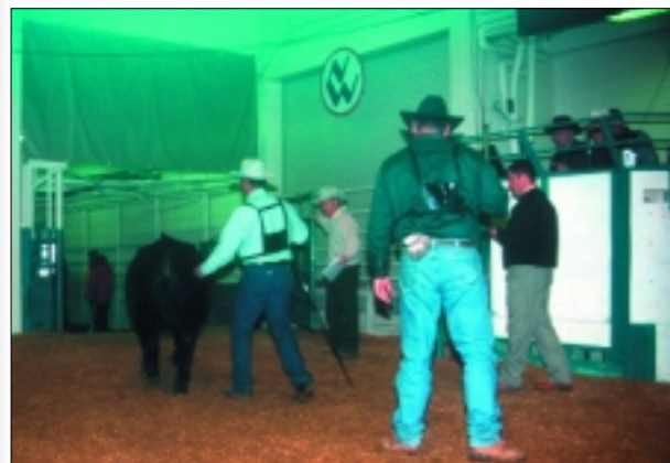
► As bulls entered the ring, data collected by ultrasound and other measurements were shown on screen for spectators to record.