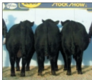
► Champion yearling pen, by Pollard Farms LLC , Enid, Okla.