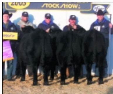
► Reserve grand champion pen Express Angus Ranches, Shawnee, Okla. Bulls sired by Bon-View New Design 1407 and WK Gunsmoke.