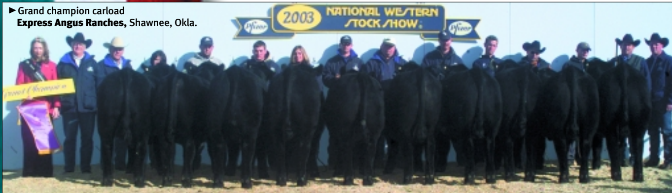
► Grand champion carload Express Angus Ranches, Shawnee, Okla.

Express Angus Ranches claimed the reserve grand champion pen of three with February and March 2002 bulls sired by Bon-View New Design 1407 and WK Gunsmoke. The bulls weighed an average of 1,190 lb. and had an average scrotal circumference of 35.33 cm. They posted an average fat thickness of 0.43 in. at the rump and 0.33 in. at the rib. They first won late calf champion pen.