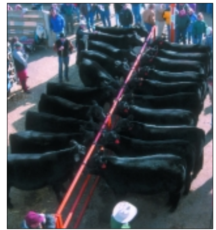
► A crowd gathered as carloads were tied up outside the Livestock Center Auction Arena in the Yards. Judges had the opportunity to reevaluate division champions to name their grand champion.