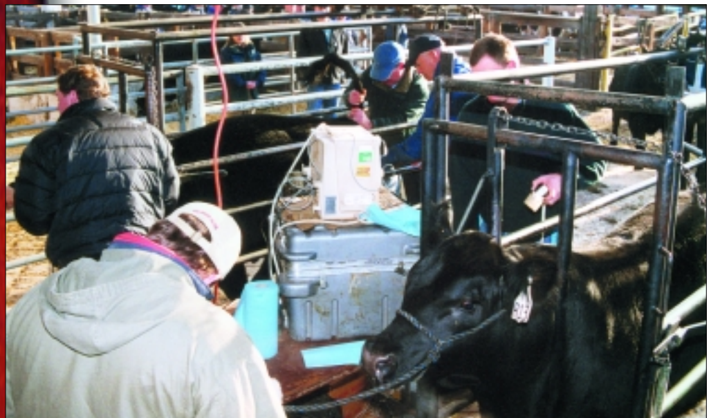
► It's a busy time when cattle are brought through check-in at the National Western Stock Show. Regional managers and ultrasound technicians collect data and make sure entries are properly identified.

All this information is entered electronically with a little help from the American Angus Association's Angus