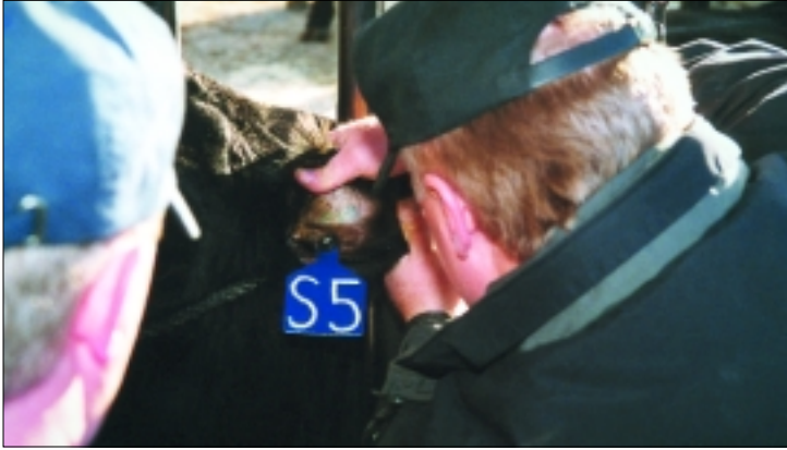
► Official registration papers must accompany each animal that is entered in any event at the NWSS. The tattoo in the ear is checked against the number listed on the paper.