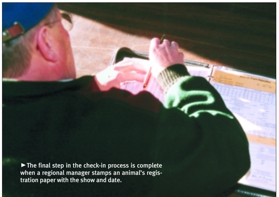
► The final step in the check-in process is complete when a regional manager stamps an animal's registration paper with the show and date.