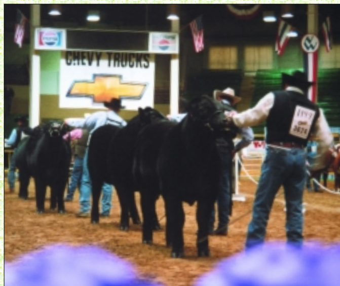
► Bulls line the ring head to tail to provide the judges with a side profile at the 97th Annual National Western Stock Show in Denver, Colo.