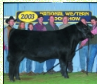
► Winter calf champion, Car Don Warm Front B592 , by Warm Front Breeders, Williston, N.D., and Laffin Bros., Olsburg, Kan. He's a Feb. 2002 son of Connealy Forefront.