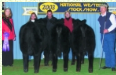
► First-place junior get-of-sire by SAV Limited Edition 9283 , exhibited by Fairlane Farm, Louisville, Ohio, and Champion Hill, Bidwell, Ohio.