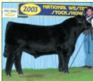
► Senior calf champion, EXAR Lakota 1852 , by Express Angus Ranches, Shawnee, Okla. He's a Sept. 2001 son of Northern Improvement 4480 GF.