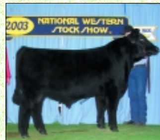
► Reserve winter calf champion, BT Notch 2M , by Beartooth Ranch, Columbus, Mont. He's a Jan. 2002 son of Baldrige Notch AC.