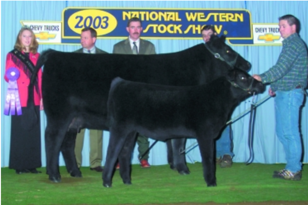
► Grand champion cow-calf pair, WCC Blackcap J238 , by Catherine Barker, Avon, Ind. She's a Sept. 2000 daughter of G13 Fortune 425C 8068. Her calf is a Sept. 2002 daughter of Bon-View New Design 1407.