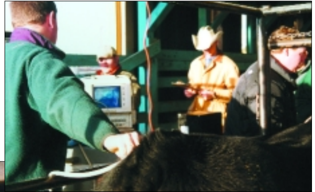
► Above: Tattoo numbers must match registration numbers for cattle to be shown at an event. Contestants should make sure the tattoo is legible and correct before traveling to the show.

The cattle aren't weighed at time of check-in. They are weighed prior to entering the showing. Exhibitors must allow time to bring their entries to the makeup area to be weighed before their class is called into the ring.