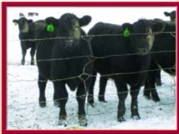
► Left: During a five-year period, S&V Cattle Co. fed 1,240 steers at Darnall Feedlots, maintaining greater than 30% CAB acceptance.