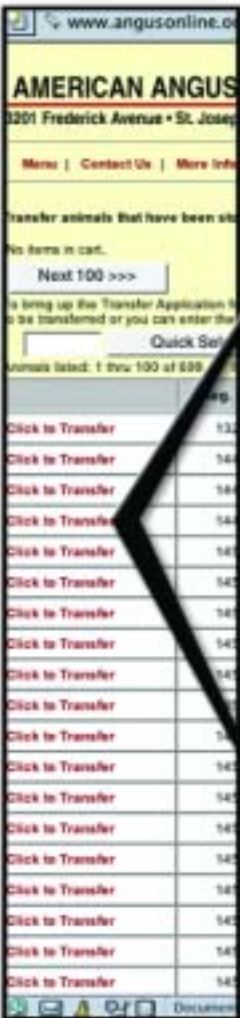
Fig. 4: Transfer screen to transfer animals with electronically stored pedigrees

If the buyer wishes to receive the traditional printed certificate after purchasing the animal, the official copy will be printed and mailed at no additional cost. Once official certificates are printed,