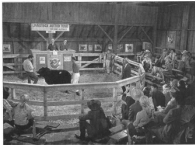
A scene in the 1960s movie "What Am I Bid?" featured an Angus bull sale.