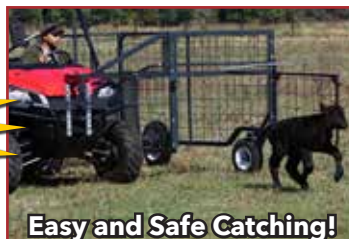
Easy and Safe Catching!

DEALER INQUIRY INVITED FACTORY DIRECT PRICING