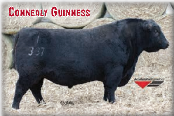
CONNELY GUINNESS Connealy Dublin x EGL Target BW 82 · WW 741 · YW 1322 BW +1.7 · WW +61 · YW +110 · Milk +27 · $B 161.13