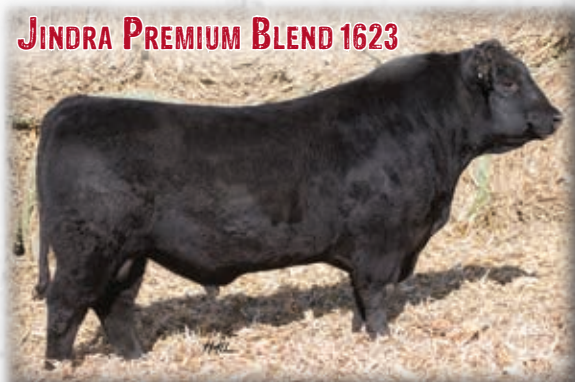
JINDRA PREMIUM BLEND 1623 Jindra Premium Blend x Hoff First Edition BW 88 · WW 799 BW +2.0 · WW +92 · YW +155 · Milk +17 · $B 196.83