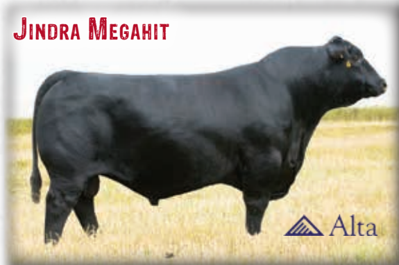
JINDRA MEGAHIT Hoff Blockbuster x Hoff Heartland BW 84 · WW 912 · YW 1571 BW +0.8 · WW +90 · YW +152 · Milk +12 · $B 200.16