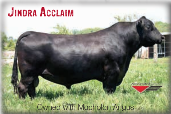
JINDRA ACCLAIM Owned with Macholan Angus 3rd Dimension x Impression BW 76 · WW 852 · YW 1577 BW +0.5 · WW +80 · YW +162 · Milk +25 · $B 21790

Colonel Renown Playbook Treasure Acclaim Megahit Stout Premium Blend 1623 Contender Rectify Beckon Guinness