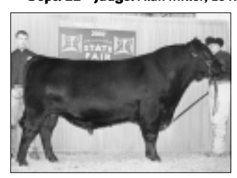
► Grand champion bull, EXAR Asset 0653, by Express Angus Ranches, Shawnee; Rocking CK Angus Ranch, Cypress, Texas; and Hays Bros. Angus Ranch, Arcadia, La. He's a March 2000 son of Northern Improvement 4480 GF.