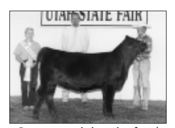
► Reserve grand champion female, CCC VRD Lady 2043, by Colyer Cattle Co., Bruneau, Idaho. She's a Jan. 2002 daughter of Vermilion Dateline 7078. CONTINUED ON PAGE 174