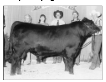
► Grand champion bull, JDH Key Heir 0451, by JDH Cattle Co., Dover, Pa. He's an April 2001 son of JDH Keystone EXT.