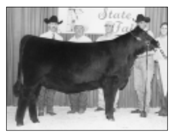
► Reserve grand champion female, PF Bardolena 1253 , by Preston Pollard, Enid, Okla. She's a Sept. 2001 daughter of Vermilion Dateline 7078.