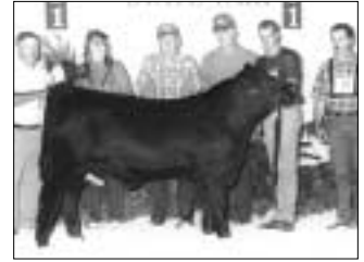
► Reserve grand champion bull, Whitestone Precision N093 , by Whitestone Farm, Aldie, Va. He's a Jan. 2001 son of GAR Precision 1680.