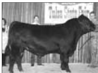
► Grand champion bull, PF 7215 Avenger 0232 , by Pollard Farms LLC, Enid, Okla., and Canadian Connection, Killarney, Manitoba, Canada. He's a Feb. 2000 son of WK Appeal.