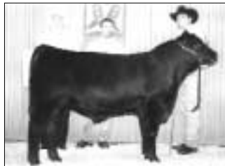
► Grand champion bull, EXAR Sudden Impact 1537 , by Express Angus Ranches, Shawnee. He's a Jan. 2001 son of Northern Improvement 4480 GF.