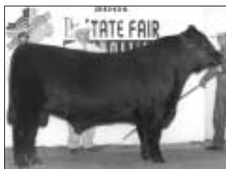
► Grand champion bull, SAR Daniel 901 , by Sandhill Angus Ranch, Holly, Colo., and Bar N L Livestock, Douglas, Wyo. He's a Jan. 1999 son of TC Stockman 365.