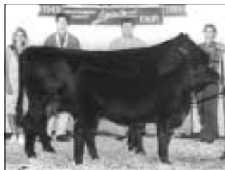
► Grand champion cow-calf pair, Burberry's Blackcap 739 , by Cortney Hill-Dukehart, Sykesville. She's an April 1997 daughter of Burberry's Right Smart 405. Her calf is a March 2001 daughter of Famous 7001.