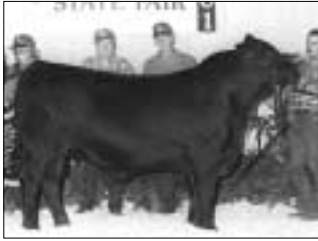
► Grand champion bull, Whitestone Treasury 343M , by Cattleman for Christ, Aldie, Va. He's a Jan. 2000 son of Whitestone Treasury J187.