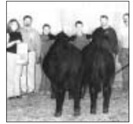
► Bippert's Farms, Alden , exhibited the best two head.