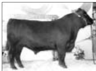
► Grand champion bull, SAR Daniel 901 , by Sandhill Angus Ranch, Holly; and Bar N L Livestock, Douglas, Wyo. He's a Jan. 1999 son of TC Stockman 365.