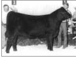
► Grand champion female, OHL Foxy Barbara 017-1 , by Fox Cross Farm, Alderson, W.Va. She's a Jan. 2000 daughter of Woodhill Supreme.