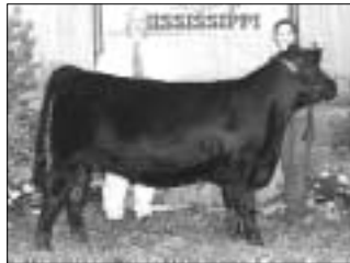
► Grand champion female, HRF 9FB3 Westwind M014 , by Thomas Wigginton, Corinth. She's a Sept. 2000 daughter of Rito 9FB3 of 5H11 Fullback.