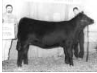
► Grand champion female, Angus Glen Favorite 4K , by Angus Glen Farm, Markham, Ontario, Canada. She's a Feb. 2000 daughter of RR Scotchcap 9440.