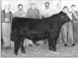
► Grand champion bull, BF Trucker 380 , by Bippert's Farms, Alden. He's a Sept. 2000 son of Krueger's Backstretch 1104.