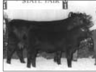
► Grand champion cow-calf pair, Burberry's Blackcap 739 , by Cortney Hill-Dukehart, Sykesville. She's an April 1997 daughter of Burberry's Right Smart 405. Her calf is a March 2001 daughter of Famous 7001.