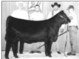
► Grand champion female, EXAR Lass 1577 , by Express Angus Ranches, Shawnee. She's a Jan. 2001 daughter of Connealy Dateline.