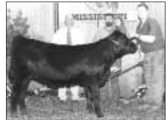
► Reserve grand champion female, Red Fox Jacyln 3L , by Red Fox Farm, Cotton Plant. She's a Jan. 2001 daughter of B/R New Design 036.