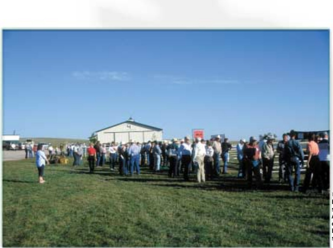
► The final stop was at Haythorn Land & Cattle Co., south of Arthur. Several area Angus producers had cattle on display and several Haythorn-bred Quarter Horse studs were on display.

► Good food, good Angus cattle and good friends were all highlights of the tour. Participants enjoyed CAB brand prime rib at the final tour stop Tuesday evening.