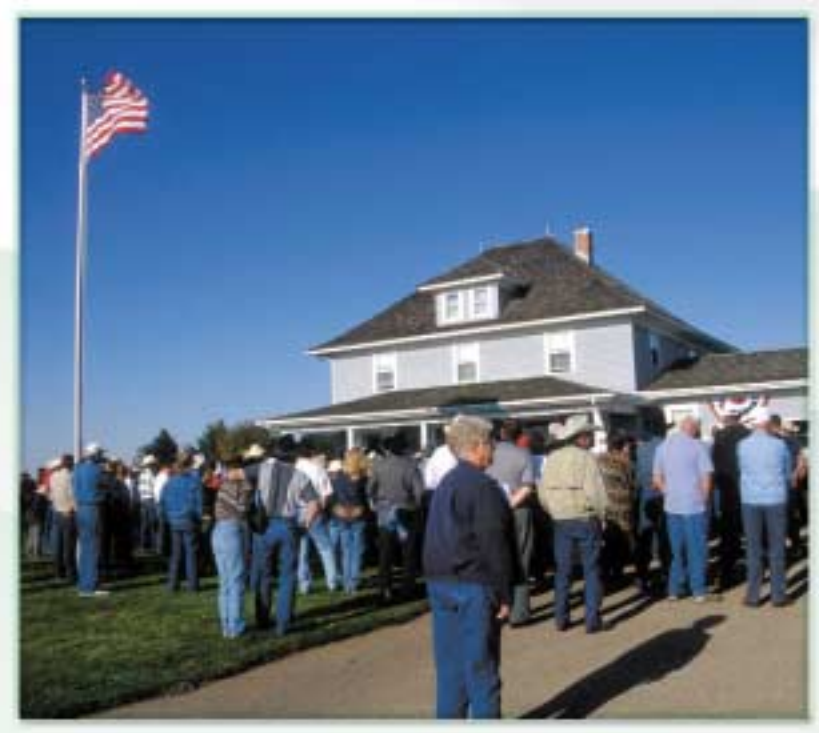
► The beautiful Wm. Zutavern Cattle Co. located on the Dismal River was stop No. 1 on Tuesday. The Zutavern family has been raising Angus cattle for more than five generations.

► The final stop before dinner on Monday night was at the Custer County Fairgrounds in Broken Bow where 26 pens of cattle were on display.