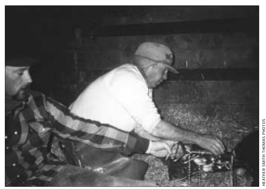
The strength of one or two people is usually adequate to pull a calf, and you are less apt to hurt the calf or the heifer.

If the calf is trying to start breathing, ease