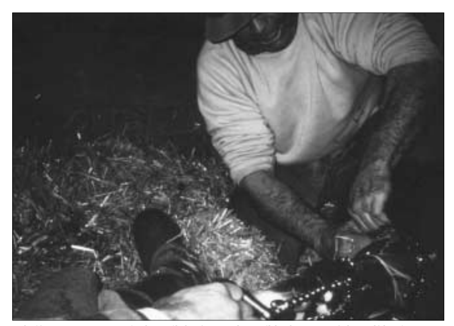
A heifer may progress nicely until the feet and possibly the nose of the calf begin to show, then stop. If you reach in, you'll find a strong band of connective tissue a few inches inside the birth canal. These rings of tissue, called a persistent hymen, are common in heifers. Stretching or breaking these is a painful, but necessary, process.

off a minute on your pulling. Constant pulling at this point will hinder the expansion of its chest, and it may suffocate. Get the calf to breathe, then finish the delivery.