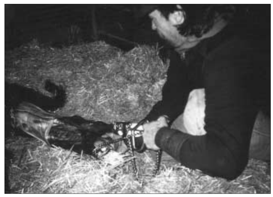
To deliver the hips, pull straight down toward the cow's feet and then pull the calf between her legs, toward her belly. This raises the calf's hips to the highest point of the cow's pelvic opening, where it is widest.