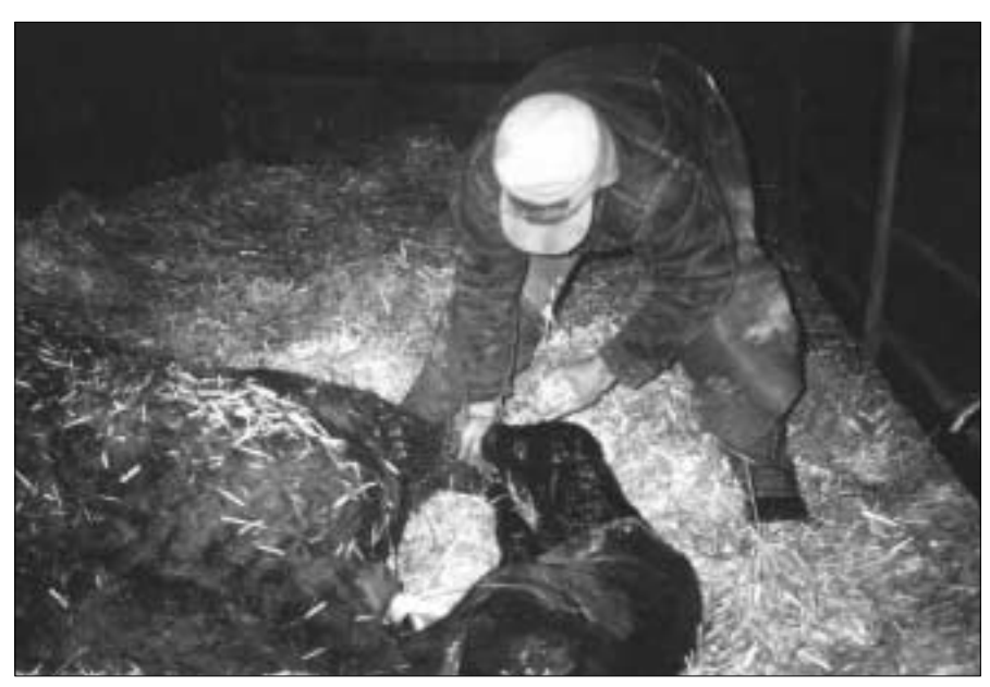
Once the calf is delivered, follow through by cleaning the mucus and membranes away from the calf's nose and making sure it is breathing.

When you are ready to pull a calf on a frontward presentation, have the puller straight out from the cow's back, Cope says. After taking up all available slack, slowly bring the end of the puller toward the level of the cow's feet as far as possible. "Lift the