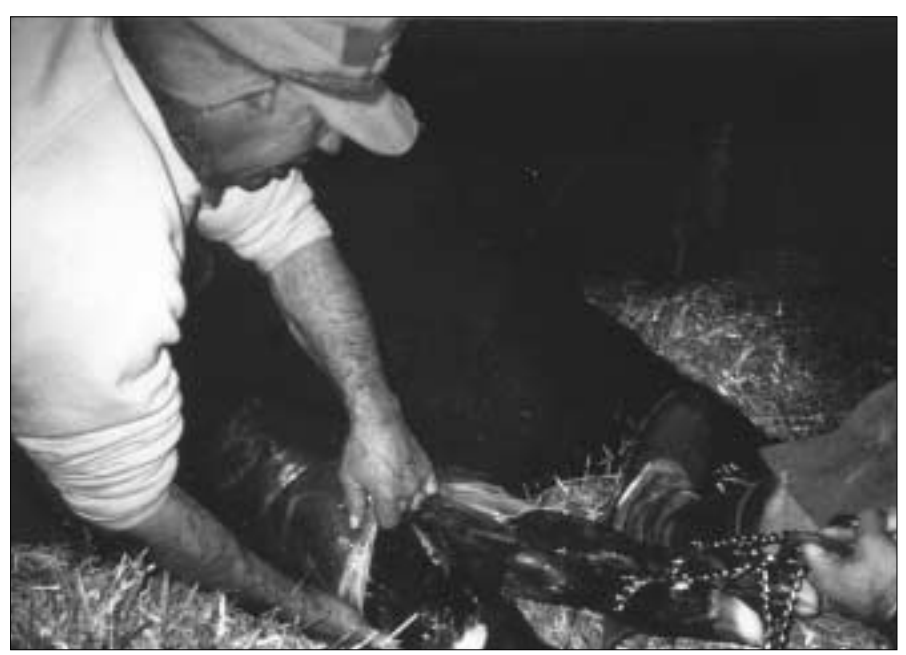
Pull one leg at a time to ease the shoulders through the pelvic opening one at a time — walking the shoulders through.