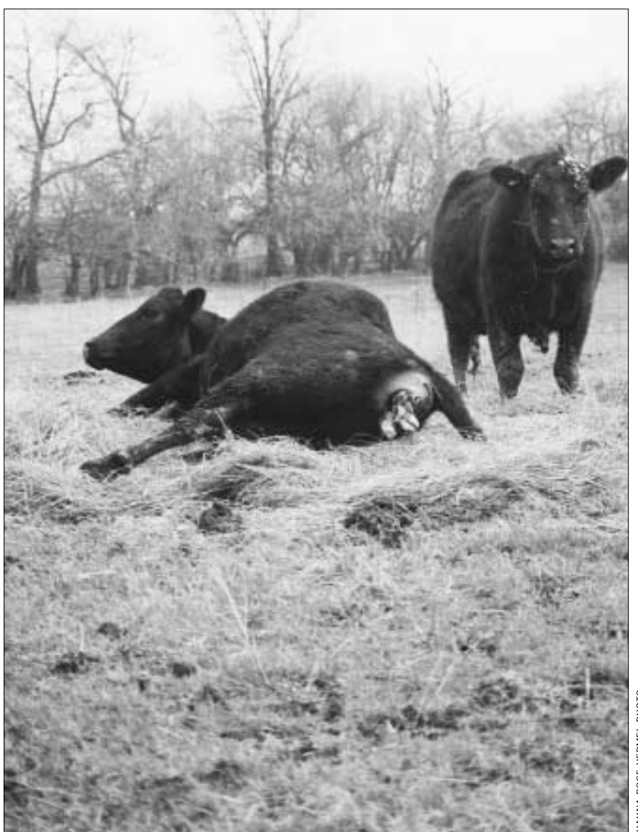
If the calf is presented properly and the heifer is working hard at pushing it out (calf's feet and nose are showing), she will be down on the ground in hard labor and less likely to try and get up.

"Strong abdominal straining is only stimulated when some part of the calf starts