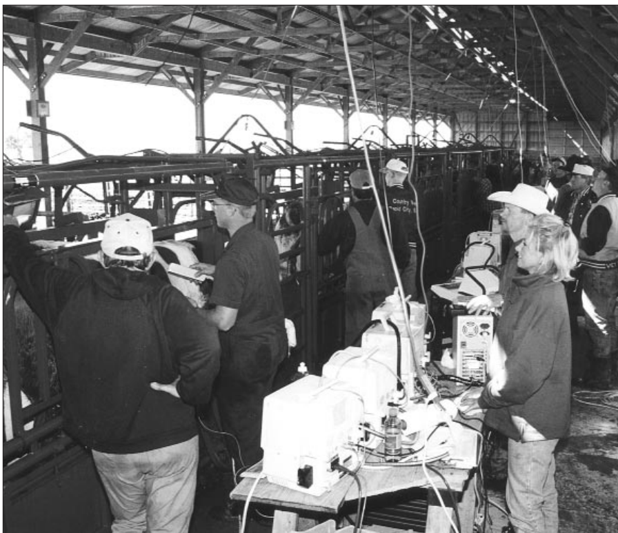
The Board got the first look at the first preliminary research report containing ultrasound EPDs on 2,153 sires in the Angus breed.

At the June Board Meeting a special committee was appointed by the president to investigate the possible retention of a business-management consultant or facilitator to assist in creating a better focus and/or strategic emphasis and allocation of resources for the American Angus Association. It was the decision of the Board to proceed with Phase I of a proposal from Moeller Management Consultants LLC.