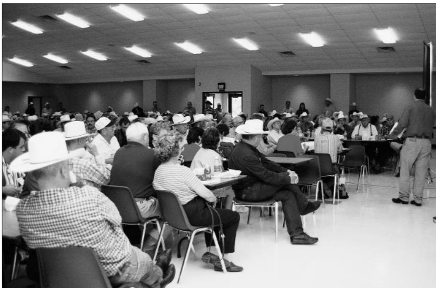
Approximately 300 people attended both the 1999 National Angus Conference and Texas Angus Tour held in Amarillo, Texas, in September (see stories on pages 39 and 45).

Two new pieces of literature were distributed to the committee, including a brochure for the Commercial Relations Department's Bull Listing Service (BLS) and an Association merchandise sheet.