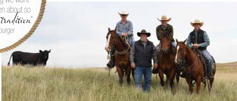
The crew at TD Angus is poetry in motion when it comes to pasture roping on their home-grown colts. Few words are spoken, yet each man knows exactly what the other needs to finish the job.

"Most of the best, those four words have changed