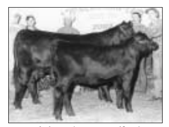
► Grand champion cow-calf pair, VPI Pridora 9J4, by Virginia Polytechnic Institute, Blacksburg, Va. She's a Jan. 1999 daughter of Leachman Prompter. Her calf is a Jan. 2002 daughter of Roth's Millcreek Unique.

▶ Reserve grand champion female, JLTJ Rockin' Bonnie L44, by T&J Cattle Co. and JL Farms, both of Raphine, Va. She's an Oct. 2001 daughter of Rockn' D Ambush 1531.