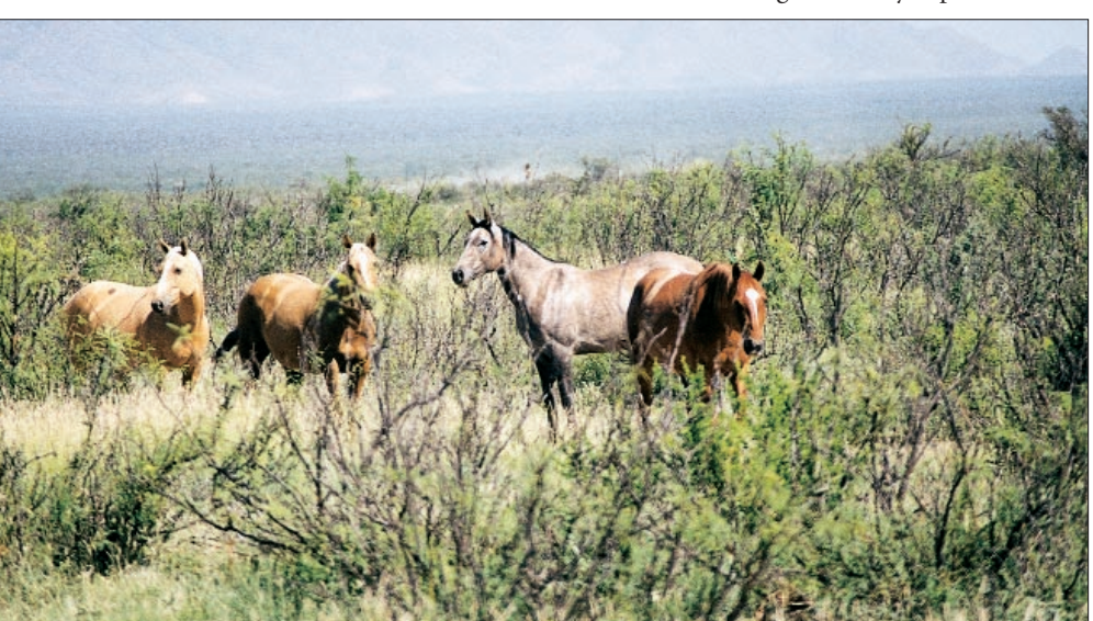
A band of 50 high-quality mares roamed the best pasture on the ranch. These mares produced all of the saddle horses and were often mated to burros, resulting in extremely good mules.

I soon realized that this was a massive spread with six different ranches, but none of them had drinking water in this highdesert country. Therefore, the one pickup on the ranch served as the delivery truck for water and supplies once a week. This was no small feat, considering that two mountain ranges and only haphazard dirt