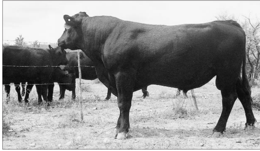
Angus bulls are being used on heifers for the first time on this ranch. Neighbors of this ranch are watching, doubtful that black cattle will survive the environmental conditions. If the bulls survive and if the calves perform respectably, I believe many area ranchers will follow suit.

upon inspection of this "shower with a broken head," I immediately decided against my plan. Not only was the shower broken, but there were about six inches of moldy water standing inside the tub. I walked outside to the spicket off the windmill and rinsed off my hair and face. I was certainly clean enough for my compadres .