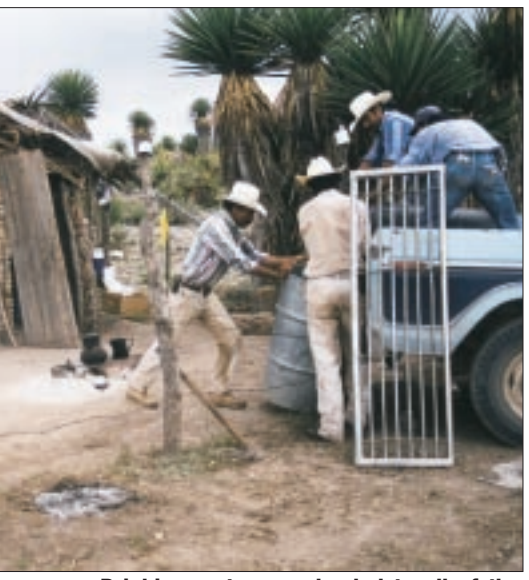
Drinking water was hauled to all of the houses on the ranch each week. Three men resided in this bamboo hut and cared for the chivas , or "goats."

I meekly asked, "Should I drink the water at the ranch?" He laughed and immediately ordered a frail young boy to place two 5gallon bottles of purified water in the cart. He then shoved a grease-soaked paper sack full of fried food toward me. I grabbed the smallest piece I could find for a taste. The