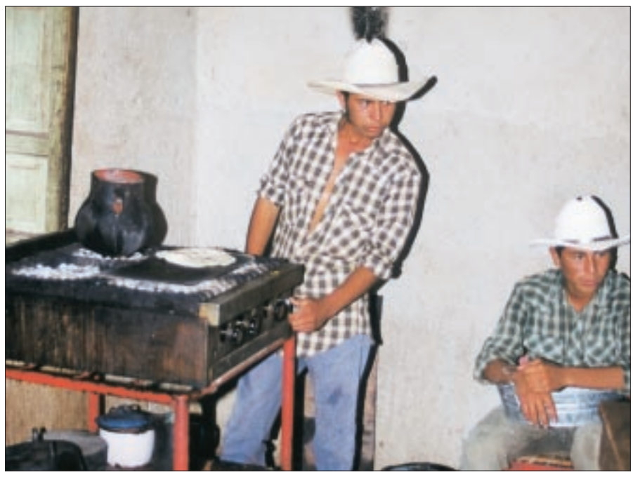
Fresh tortillas were mixed, rolled and grilled each morning and evening. They were a staple food, along with extremely sweet "cowboy coffee," potatoes and beans.

pieces resembled small, elongated chunks of fried chicken gizzards, but I was uncertain of their true identity.