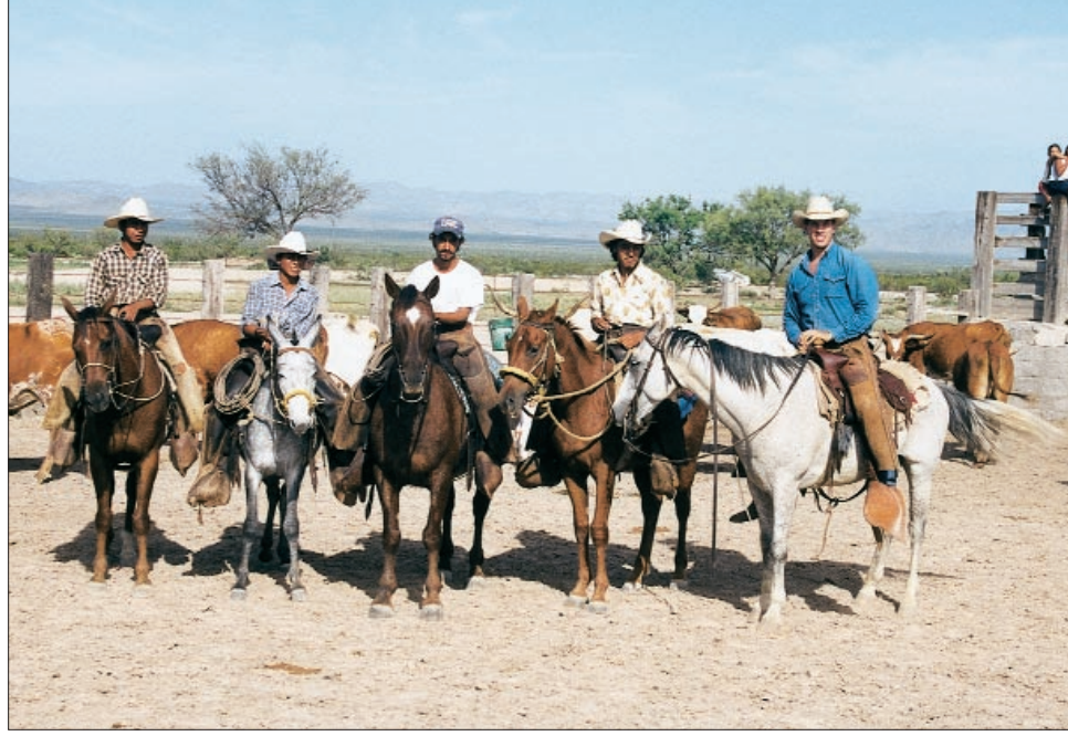
Another self-portrait was taken with the assistance of the timer on my camera. This was shot after gathering a group of 50 Longhorn pairs. Out of breath from the sprint to my horse and barely in the saddle, it gave new meaning to a "Photo Finish."

I thought it was odd that the meat was not put into a refrigerator, but a quick scan of the grounds showed that there was no electricity with which to run a cooling device. There was a propane bottle, but it was utilized solely for cooking on the gas stove. There were no phone lines, and the two-way radio tower was rusted like it had