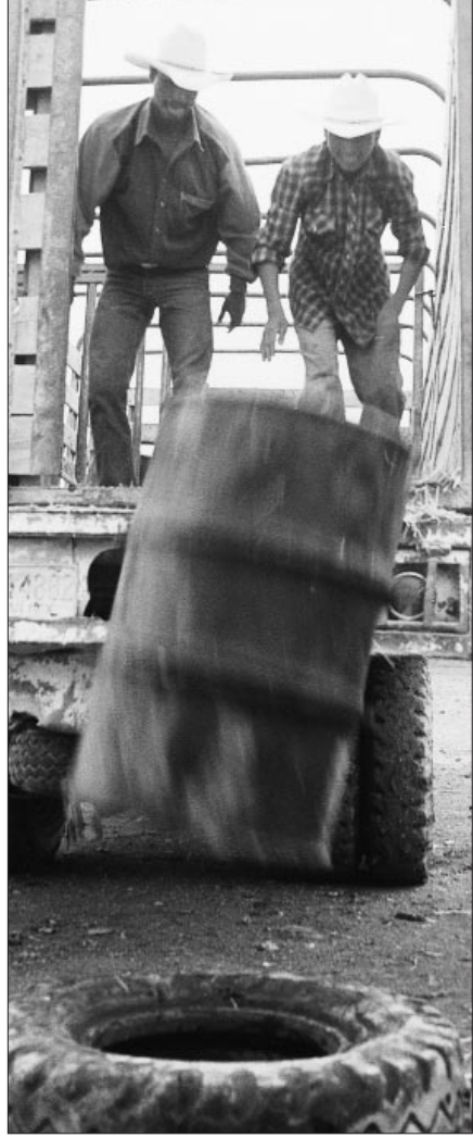
Fifty-gallon barrels full of gasoline and diesel fuel for the pickup, dozer and truck were unloaded in primitive fashion. The tire was positioned on the ground to decrease the sudden impact; but judging by the numerous dents on the barrels, it did not totally solve the problem.

I dared to try it, I realized that it was very tasty after two days in my room — possibly a "new" aging process for red meat!