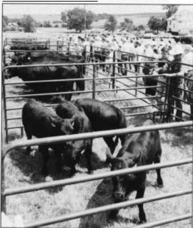
Cattle representing several Kansas Angus herds were on display during Kansas Angus Field Day activities at the Mill Brae Ranch.