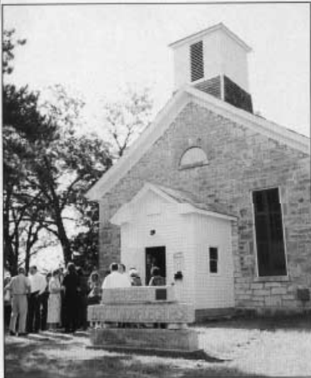
Church services were held at the historical Beecher Bible and Rifle Church in Wabaunsee. This church, built from 1859-62 and dedicated in May of 1862, is Kansas' oldest church using its original building.