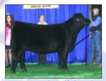
► Reserve senior calf champion, BAAR Wendy 2226 , by Broken Arrow Angus Ranch, Lincoln, Calif., and Fox Cross Farm, Alderson, W.Va. She's a Sept. 2002 daughter of Twin Valley Precision E161.