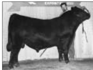
► Senior bull calf champion, Bear Mtn. Dateline 2344 , by Bear Mountain Angus Ranch, Melba, Idaho. He's a Sept. 2002 son of WK Dateline 7270.