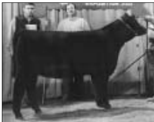
► Junior heifer calf champion, LaGrand Primrose Lady H307 , by LaGrand Angus Ranch, Freeman, S.D. She's a Jan. 2003 daughter of WCC Special Design L309.