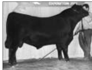
► Intermediate champion bull, Bear Mtn. Freightliner 2301 , by Bear Mountain Angus Ranch, Melba, Idaho. He's a May 2002 son of Connealy Freightliner.