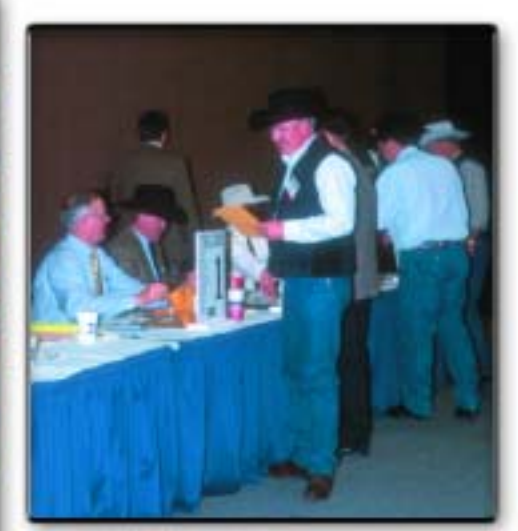
► More than 300 delegates from 42 states, Washington, D.C., and Canada checked in to conduct the official business at the American Angus Association's 120th Annual Meeting.