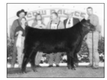
► Grand champion female, HAVE Polly TVP H122 , by HAVE Angus, Wilton, Calif. She's a Feb. 2002 daughter of Twin Valley Precision E161.