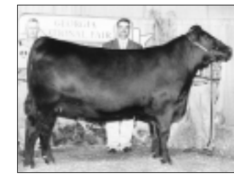
► Grand champion female, Boyd B/R Ruby of Tiffany 1074, by Kahn Cattle Co. LLC, Rydal. She's a Feb. 2001 daughter of JLB Exacto 416.