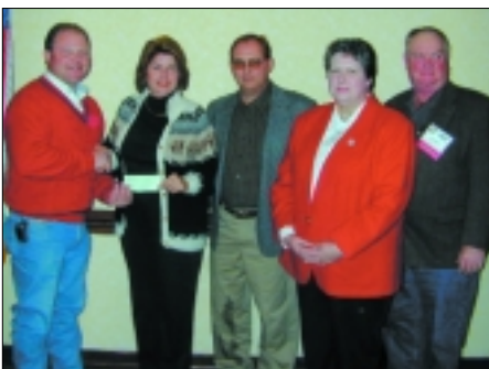
► Left: Several items were auctioned at the Annual Reception to raise funds for the 2003 National Junior Angus Show. The Wisconsin Junior Angus Association purchased a sexed heifer pregnancy for $4,000, then donated the pregnancy back to the 2003 NJAS to auction again. The pregnancy resold for $3,000 to Sugar Springs Ranch, Lincoln, Ark.