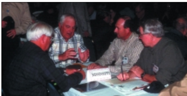
► Three hundred twenty-seven delegates convened Monday afternoon, Nov. 18, to conduct the business of the American Angus Association at the organization's 119th Annual Meeting.