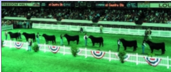
► The judges evaluate a class in the super-point ROV Angus show before a crowd of onlookers Monday, Nov. 18. In a change of schedule from past years, cow-calf pairs and bulls were evaluated Monday, and females were judged Tuesday.