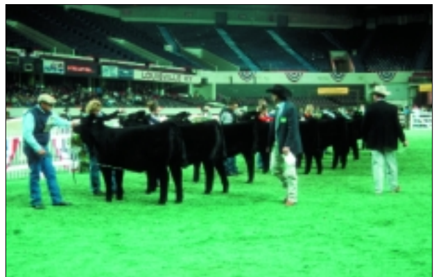
► Angus activities at the 2002 NAILE and the 2003 National Angus Show wrapped up with the ROV female show Tuesday, Nov. 19.