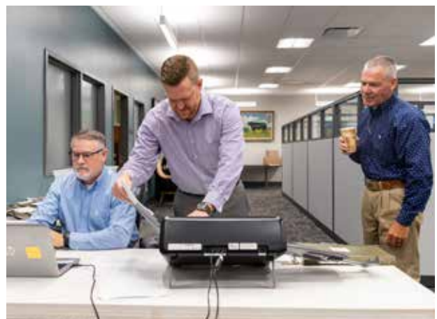
Election observers assisted Association staff with verifying ballots to elect delegates and alternates to the 140th Annual Convention of Delegates.