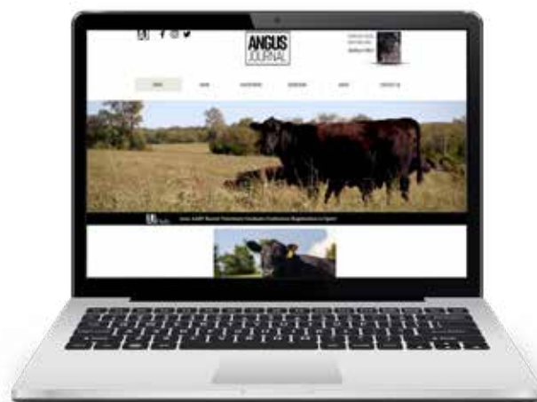
1st place publication website, Angusjournal.net