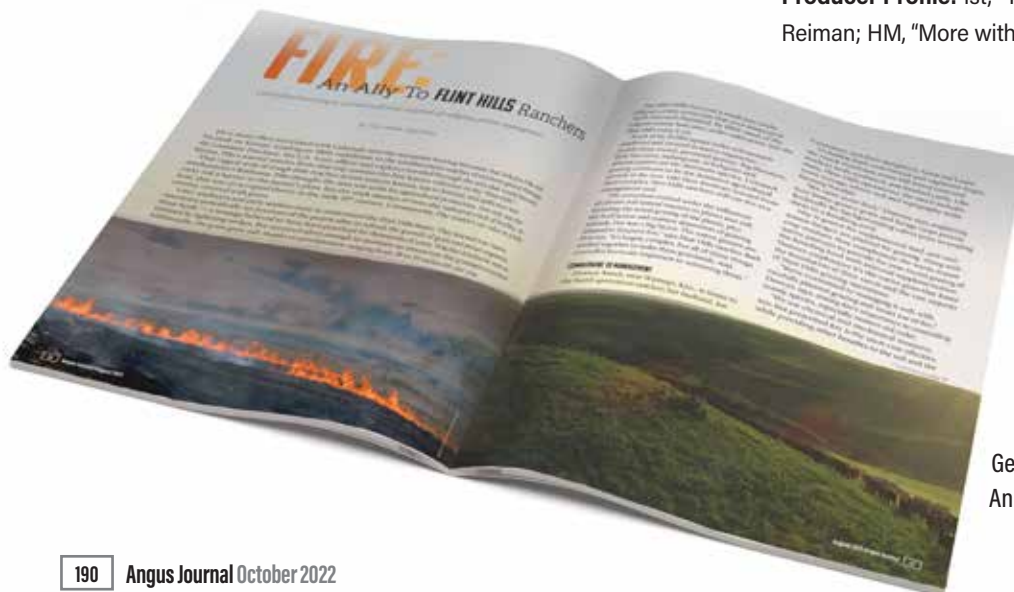
General Excellence, Story Package: 1st, "Fire: An Ally to Flint Hills Ranchers," Angus Journal