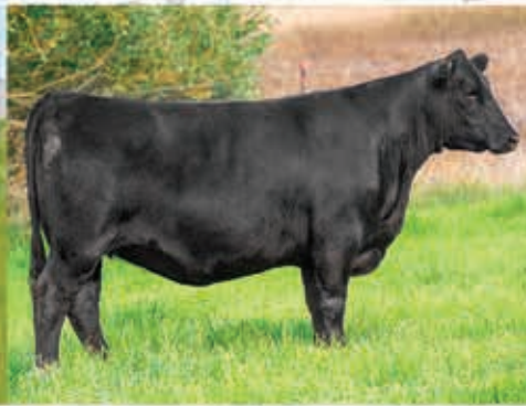
KG Enchantress 0022 | Reg: 19712559 HA Cowboy Kind 8157 x Sitz Dividend 649C