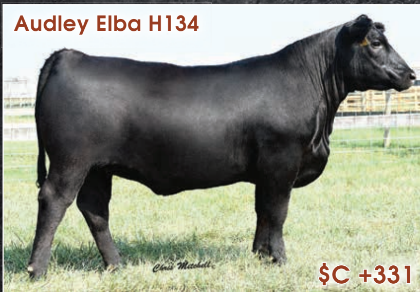
Audley Elba H134

Rita J046 has a unique combination of growth, carcass, $B and $C and blends the proven carcass and former $B and $C leader, West Point with an outstanding and proven daughter of the balanced-trait female sire, Generation who stems from a direct daughter of the former Edisto Pines and Deer Valley donor, Rita 0307 by Ten X.