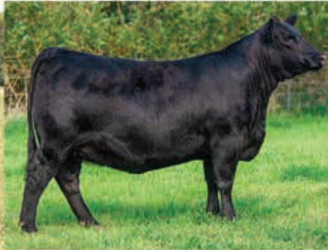
StreamSide Ever Entense 2011 Reg: +*19802328 PVF Insight 0129 x S A V Resource 1441