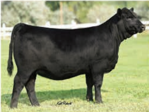
Basin Lucy 1033 | Reg: +*20071753 Vermilion Spur E143 x EXAR Denver 2002B