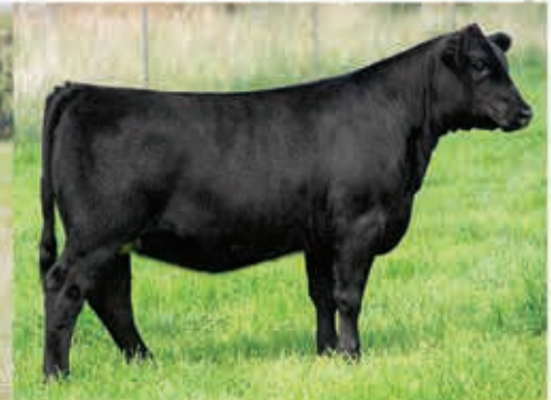
HA Blackcap Lady J554 | Reg: 20119641 HA Cowboy Kind 8157 x A A R Ten X 0083