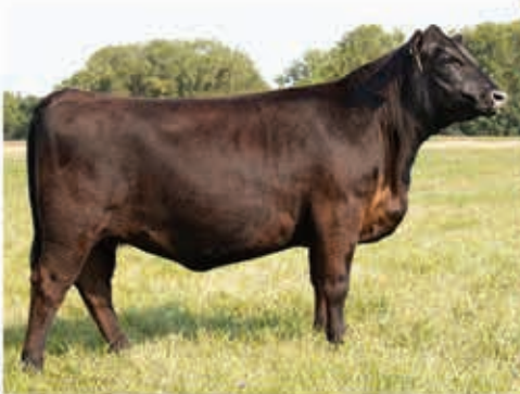
Vermilion Lass 0114 | Reg: 19767836 Vermilion Spur D125 x Connealy Doc Neal