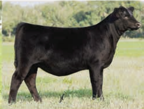
JLF Princess 1114 | Reg: 20115293 PVF Insight 0129 x Silveiras Style 9303