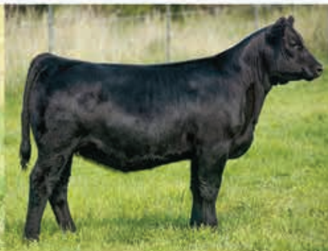
OX Buena 1254 | Reg: 20122761 Square B Atlantis 8060 x Ox Bow Ozzie 3233