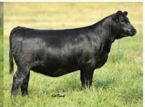
McD-2-4 Camilla's Pride 1200 Reg: 20104839 McD Effective 789 x Basin Yellowstone R178

Montana's Finest Angus Female Sale – Saturday, October 23, 2021