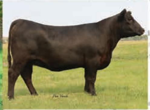
GMAR Spur G606 | Reg: +*19591046 Connealy Spur x Barstow Cash