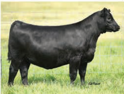
JC Everelda Entense 120J Reg: 20098054 BUBS Southern Charm AA31 x SydGen C C & 7