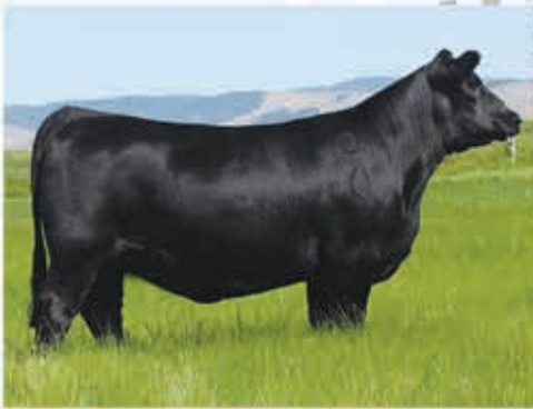
SRS Rose 0218H | Reg: +*19861053 Hoover No Doubt x Soo Line Motive 9016