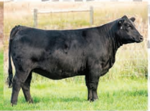
Sitz Everelda Entense 1360 Reg: 19673768 Sitz Stellar 726D x SITZ Logo 12964